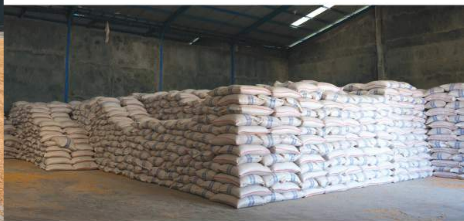
Photo of Drying Floors and Warehouse of PT. Bumi Universal Makmur in Sumbawa.