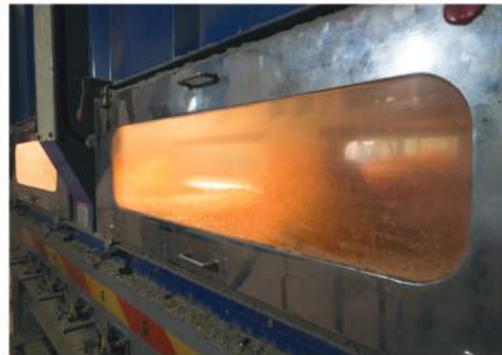
Corn drying process by drying machine