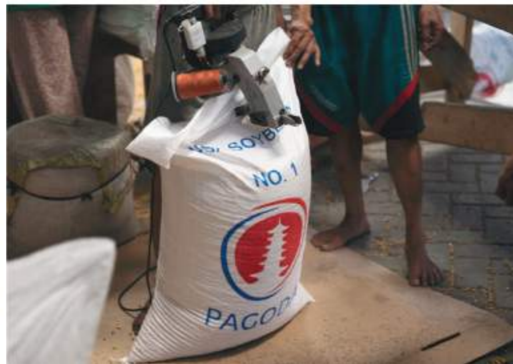
Process of blowing and packing soybeans