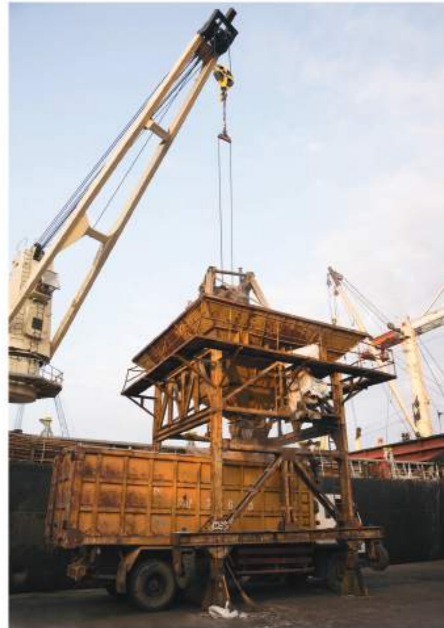
Unloading process in Tanjung Perak Harbour of Surabaya.