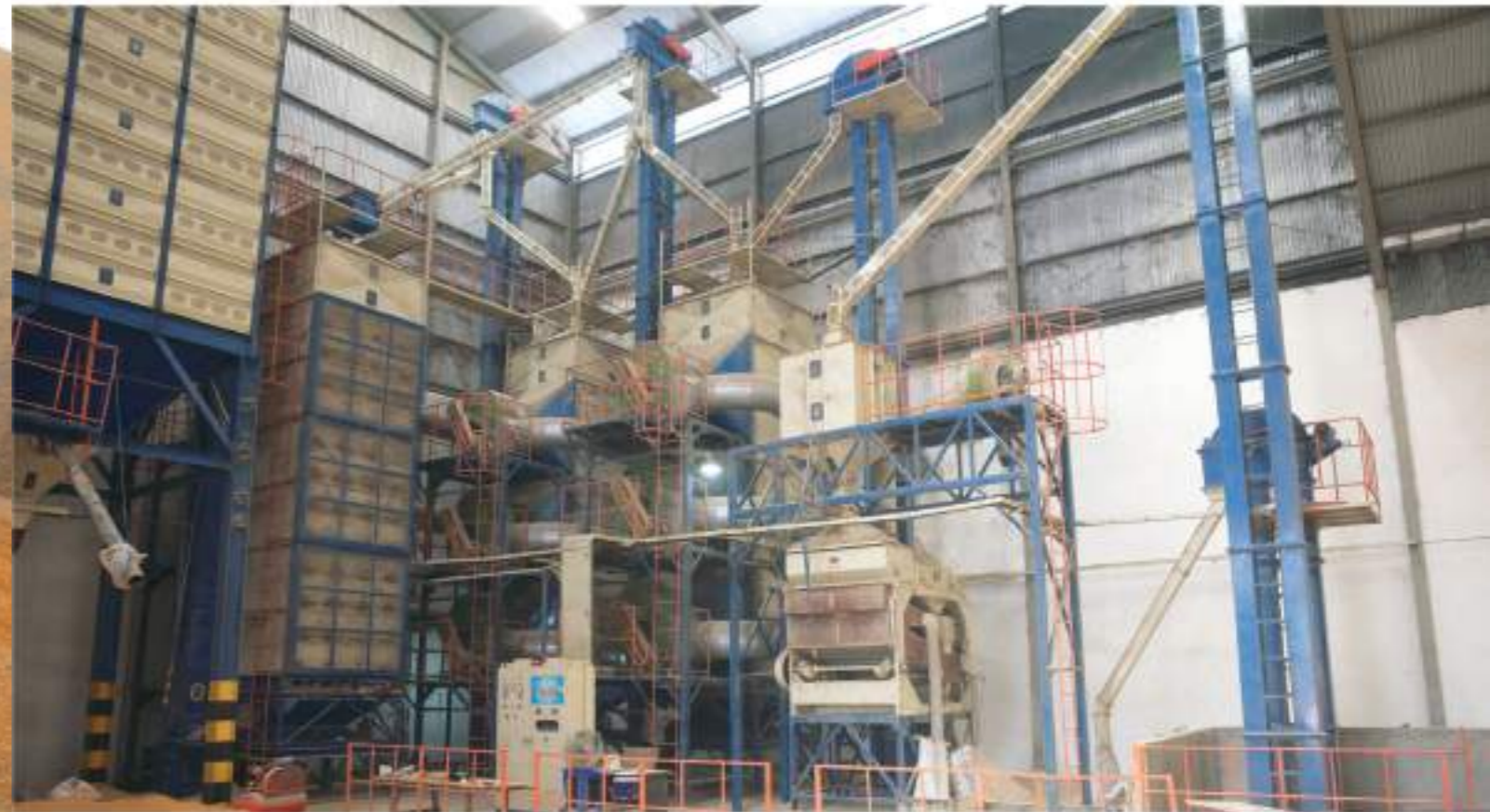
Photo of Conveyor and Warehouse of PT. Bumi Universal Makmur in Plampang.