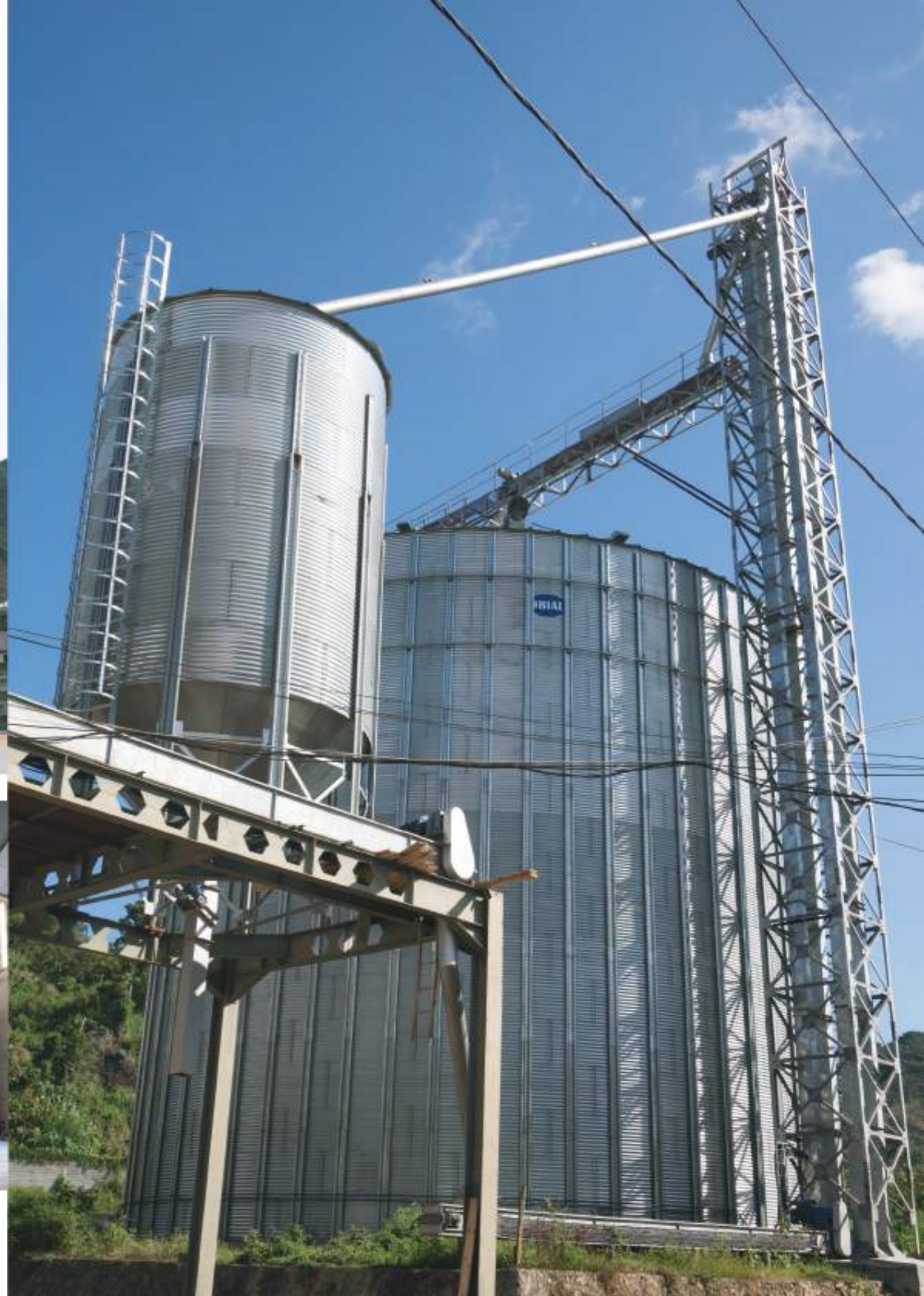
Photo of Warehouse of PT. Bumi Universal Makmur in Dompu.