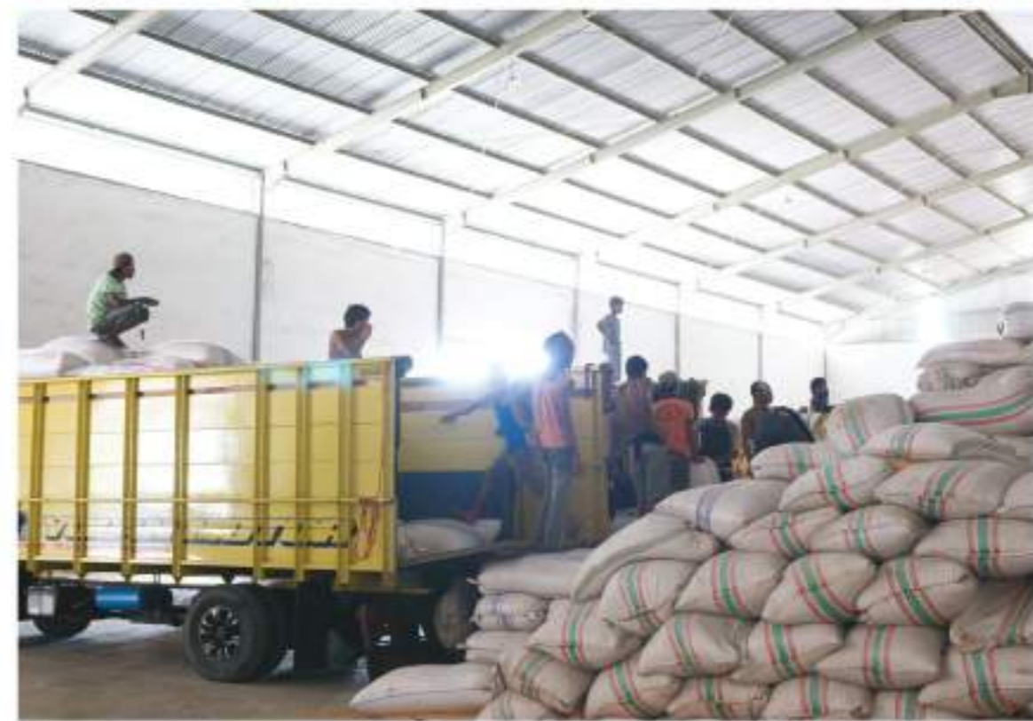
Loading process of corn in sacks to trucks