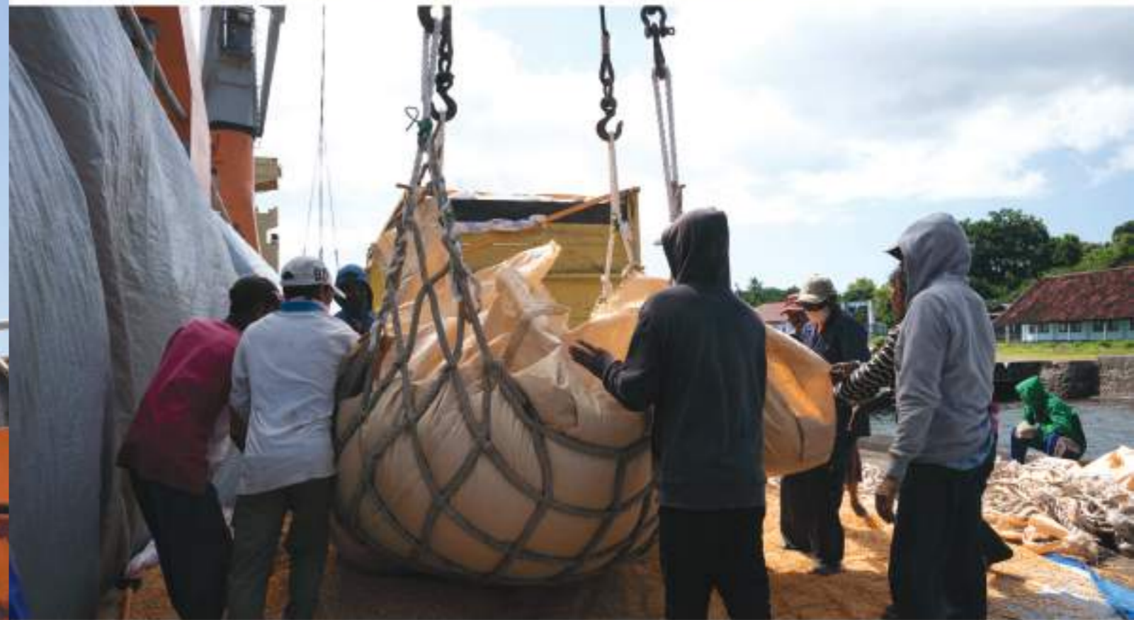
loading process from trucks to boat, in Calabai Harbour of Dompu, West Nusa Tenggara