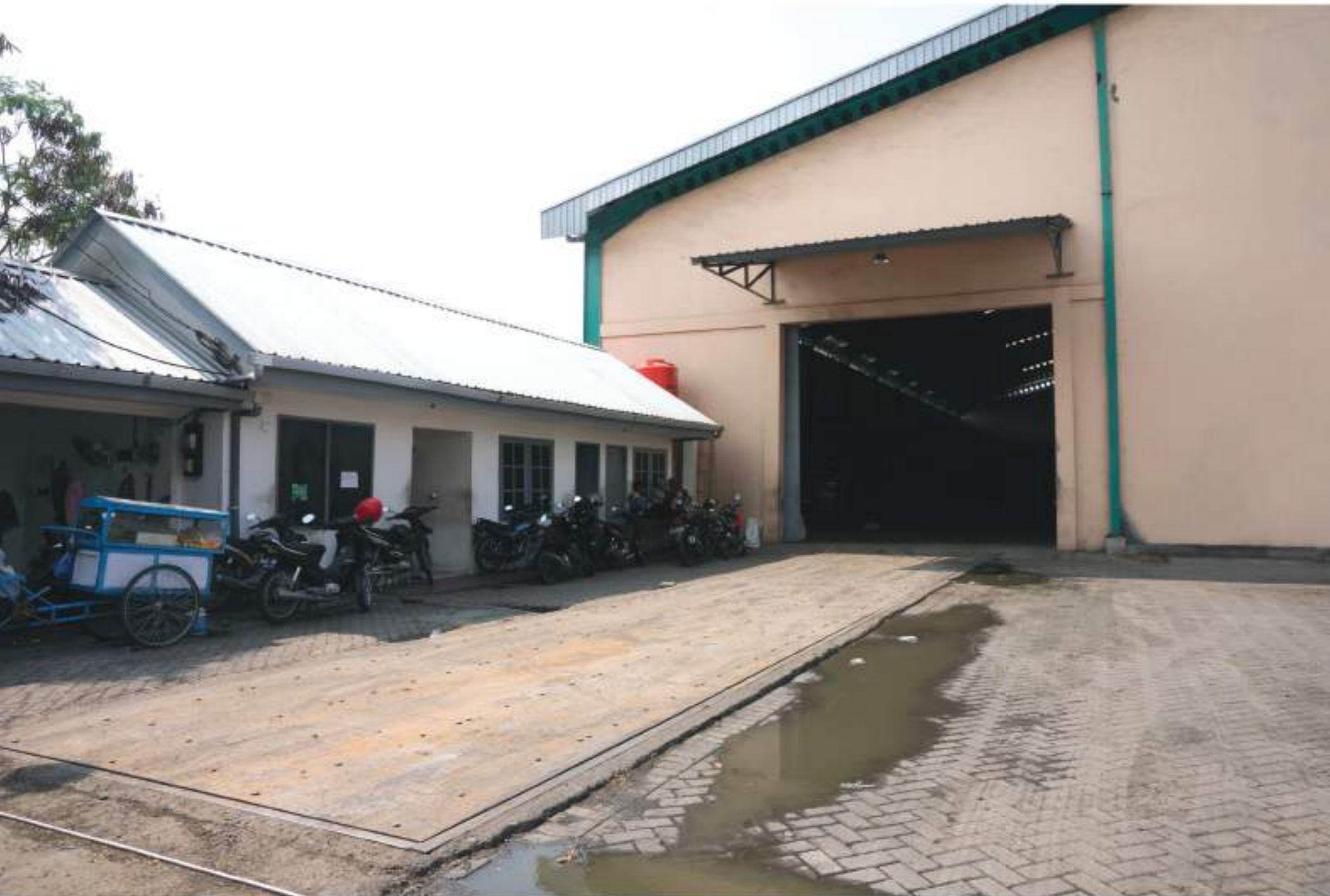
Photo of one of the warehouses in Surabaya.