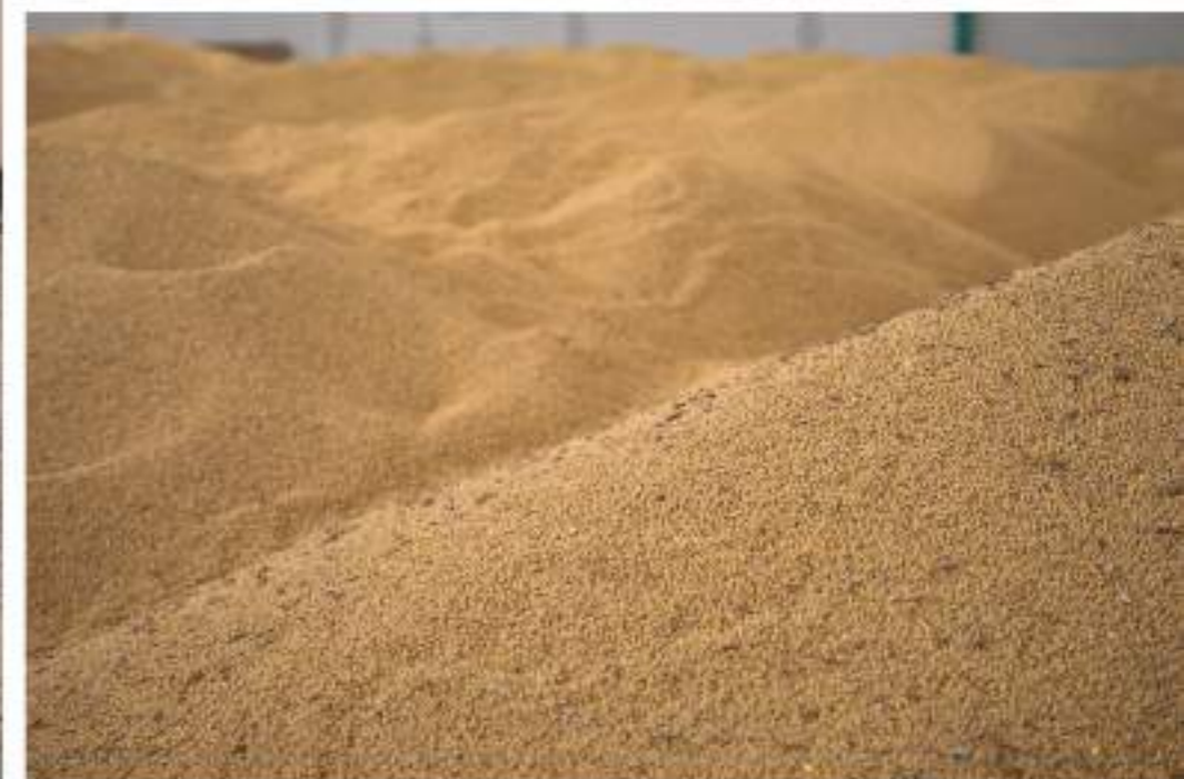
Photo of warehouse full of soybeans.