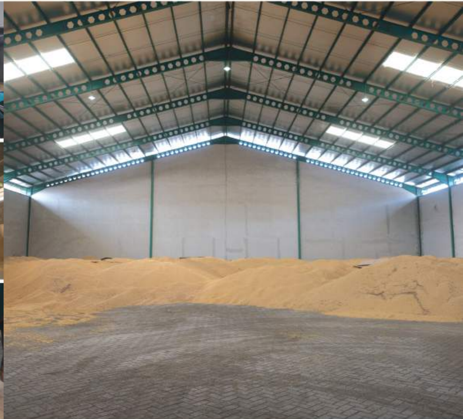
Photo of office and activities in the warehouse in Surabaya.