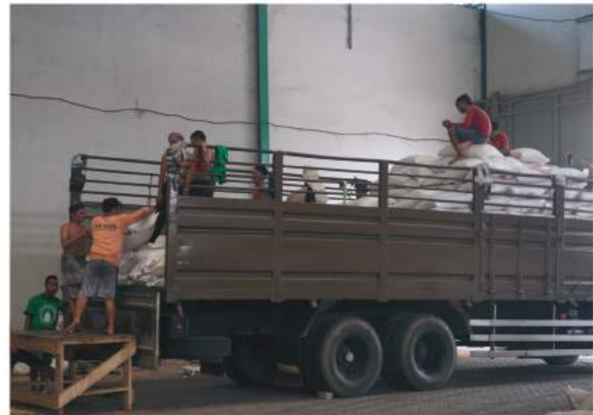
Loading process of packed soybeans PAGODA, USA Soybean No. 1 to trucks.