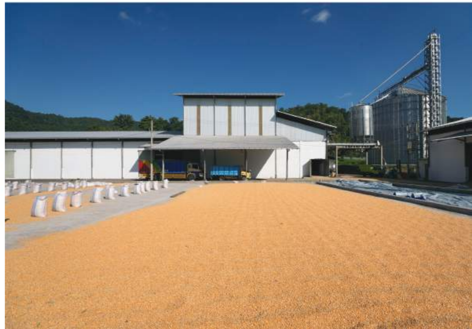
Weighing process, quality selection, and corn drying.