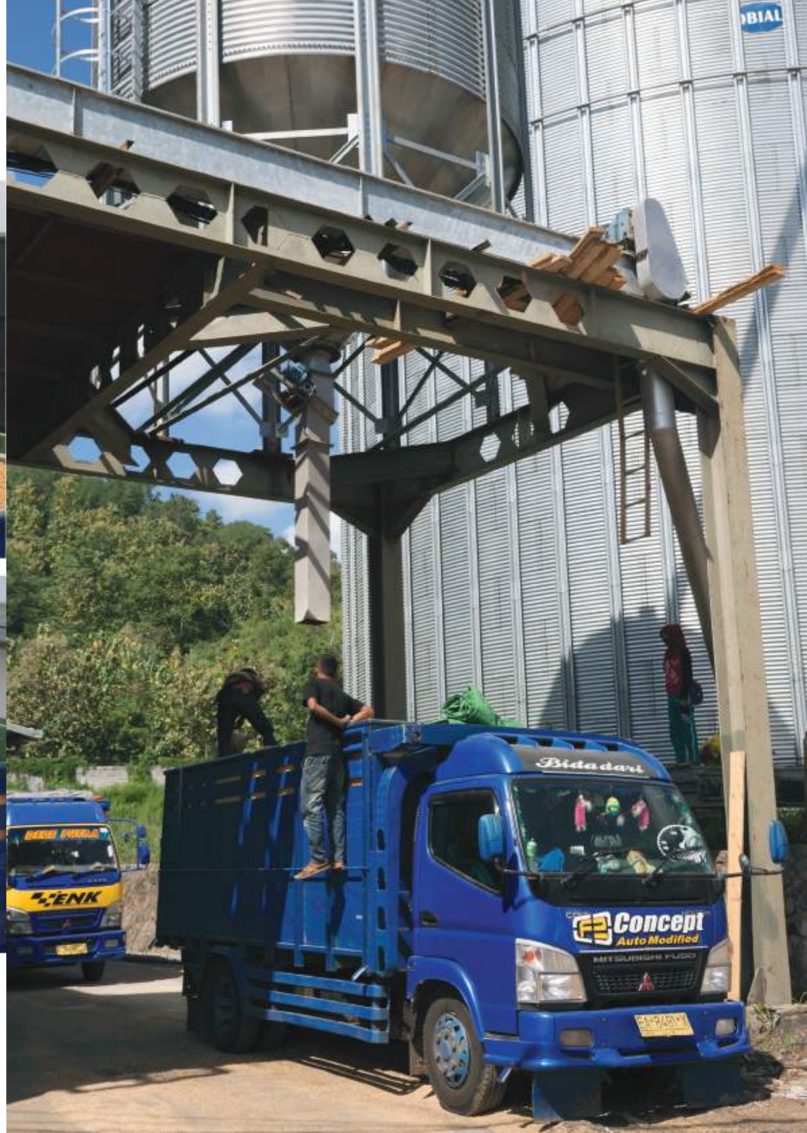
Loading process of corn from silo to trucks.