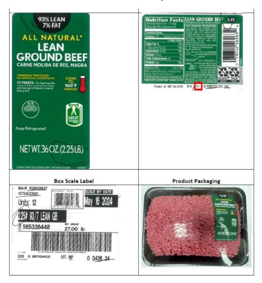
May 1: Cargill Meat Solutions is recalling about 16,243 pounds of raw ground beef products that may be contaminated with E. coli.

Product(s) affected : Raw ground beef products produced on April 26 - 27, 2024, and shipped to Walmart stores across the U.S. These are the <u>affected packages</u>: