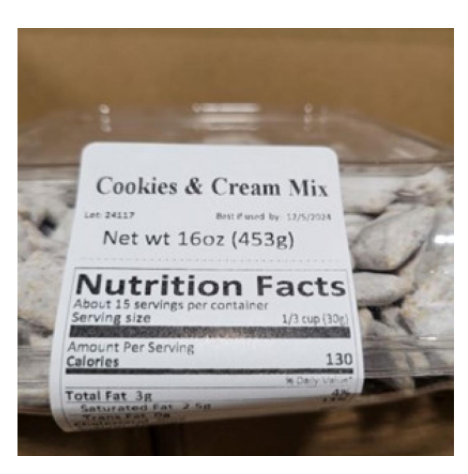
May 6: Hy-Vee is recalling two varieties of their Hy-Vee Cream Cheese and their bulk-packaged Cookies & Cream Mix due to potential for salmonella contamination.

Product(s) affected : The affected products were distributed to Hy-Vee, Hy-Vee Drugstores, and Dollar Fresh Market, Hy-Vee Fast, and Fresh convenience stores across Illinois, Iowa, Kansas, Minnesota, Missouri, Nebraska, South Dakota, and Wisconsin. Here's the packaging information for all three products.