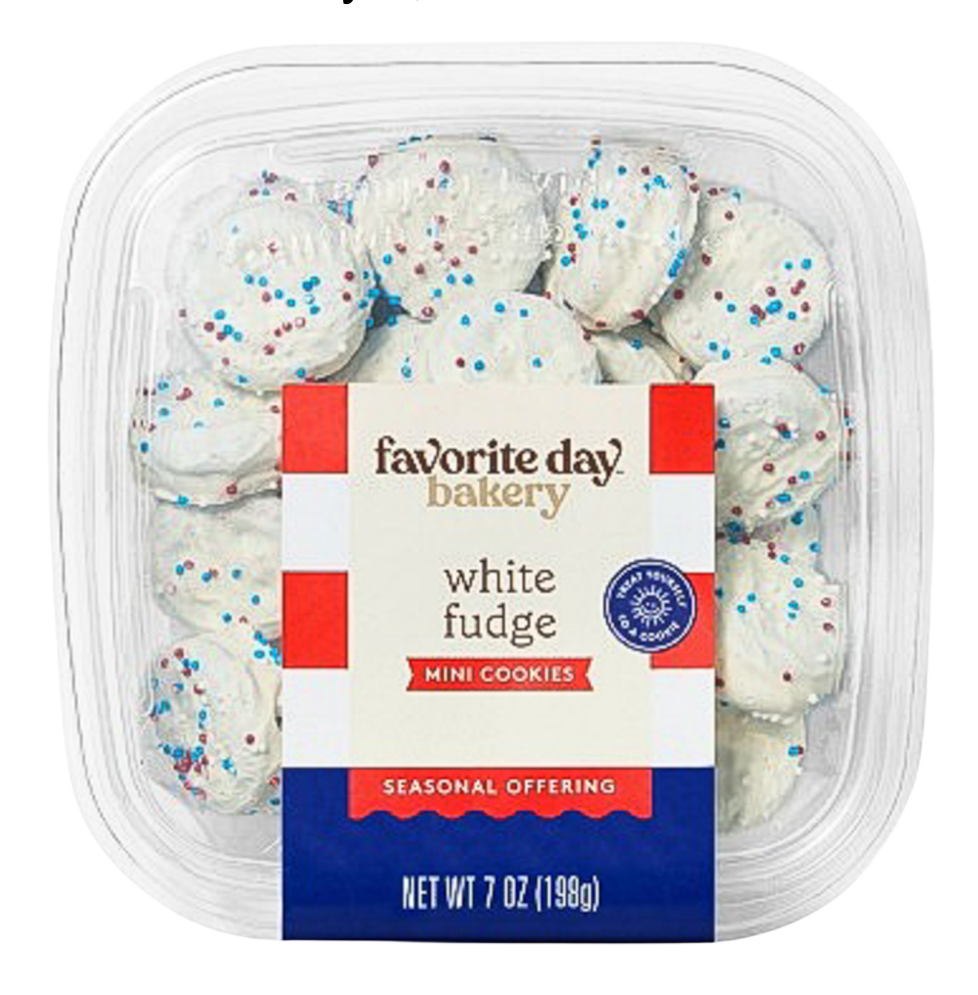
May 5: The Palmer Candy Company is recalling White Confectionary Products due to possible salmonella contamination.

Product(s) affected : The recalled items were distributed to retailers and wholesale distributors nationwide. Retailers include Dollar General, Hy-Vee, Target, and Walmart. Distributors are located in Alabama, California, Florida, Illinois, Iowa, Kansas, Missouri, Nebraska, North Dakota, Oregon, Pennsylvania, South Carolina, South Dakota, Texas, Virginia, Wisconsin, and Wyoming. Product packaging may vary such as bags, tubs, and pouches.