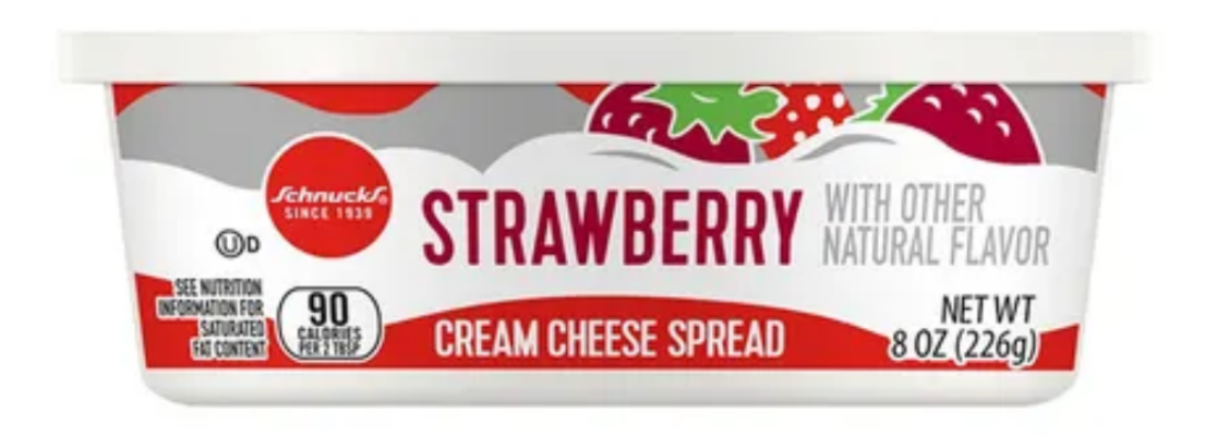
May 4: Schnucks is recalling three cheese spreads due to possible salmonella contamination.

Product(s) affected : Schnucks private-label cheese spreads, including Whip Cream, Strawberry, and Cream Cheese.