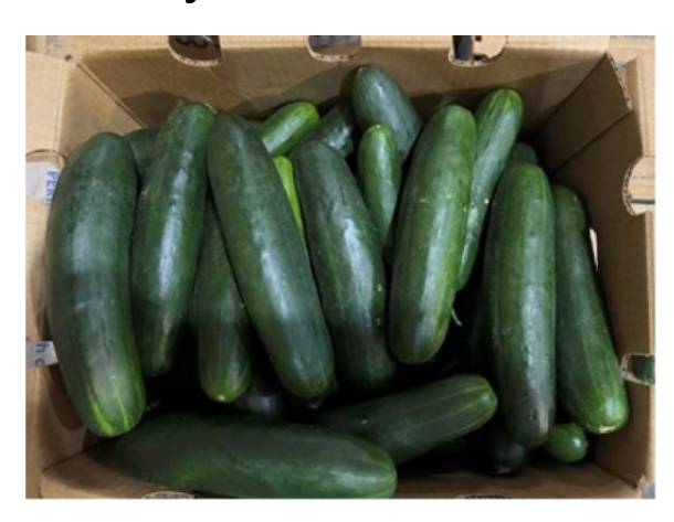
May 31: Fresh Start Produce Sales Inc. is recalling whole cucumbers (mini and English cucumbers aren't included in this recall) due to the potential for salmonella contamination.

Product(s) affected : Fresh whole cucumbers (1.5" - 2" diameter and 5" - 9" long) shipped (May 17 - 21, 2024) to retail and food distribution centers and wholesalers in Alabama, Florida, Georgia, Illinois, Maryland, North Carolina, New Jersey, New York, Ohio, Pennsylvania, South Carolina, Tennessee, Virginia, and West Virginia.