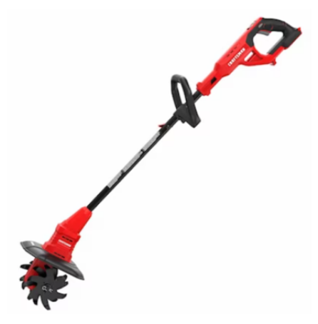
May 30: Black+Decker is recalling Craftsman V20 Cordless Tillers/Cultivators because original assembly instructions may cause users to install the bottom portion of the tiller/cultivator upside down. If attached improperly, the tines can rotate toward the user, posing a potential laceration hazard.

Product(s) affected : About 44,400 Craftsman V20 Cordless Tillers/Cultivators sold from Oct. 2022 - April 2024 at Ace Hardware, Blain's Farm & Fleet, Lowe's, certain Army & Air Force Exchanges, and online at Amazon. The model affected is red and black with "CRAFTSMAN" on the handle and the bottom portion. It has UPC# 885911843430 and model number CMCTL320B (located on the underside of the upper handle).