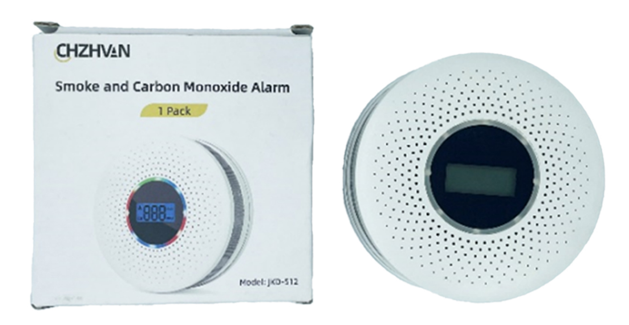
May 16: CHZHVAN Combination Smoke and Carbon Monoxide Detectors because of reports they fail to activate in the presence of smoke.

Product(s) affected : 6,800 CHZHVAN Combination Smoke and Carbon Monoxide Detectors (model number JKD-512) sold on Amazon between Aug. 2023 - Jan. 2024.