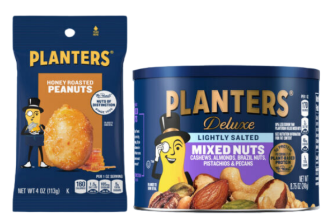
May 3: Hormel Foods Sales LLC is recalling Planters Honey Roasted Peanuts, 4 oz, and Planters Deluxe Lightly Salted Mixed Nuts due to potential Listeria contamination.

Product(s) affected : Planters Honey Roasted Peanuts (4 oz) and Deluxe Lightly Salted Mixed Nuts (8.75 oz) shipped to Publix distribution warehouses in Alabama, Florida, Georgia, and North Carolina and Dollar Tree distribution warehouses in Georgia and South Carolina.