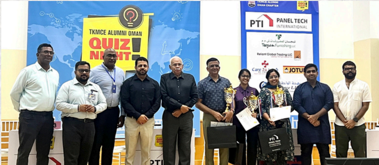
NSSCE OMAN Chapter became winners in the Quiz competitions conducted by TKM Oman alumni on August 22nd, 2025.