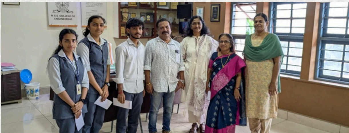
Scholarships worth 10K each were awarded to 3 students by 1985-89 (koottam) batch.