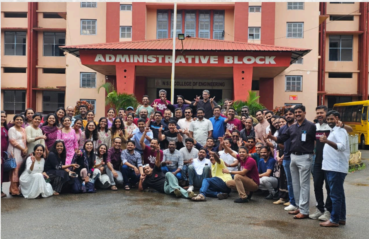
Reunion batch of 2001-05