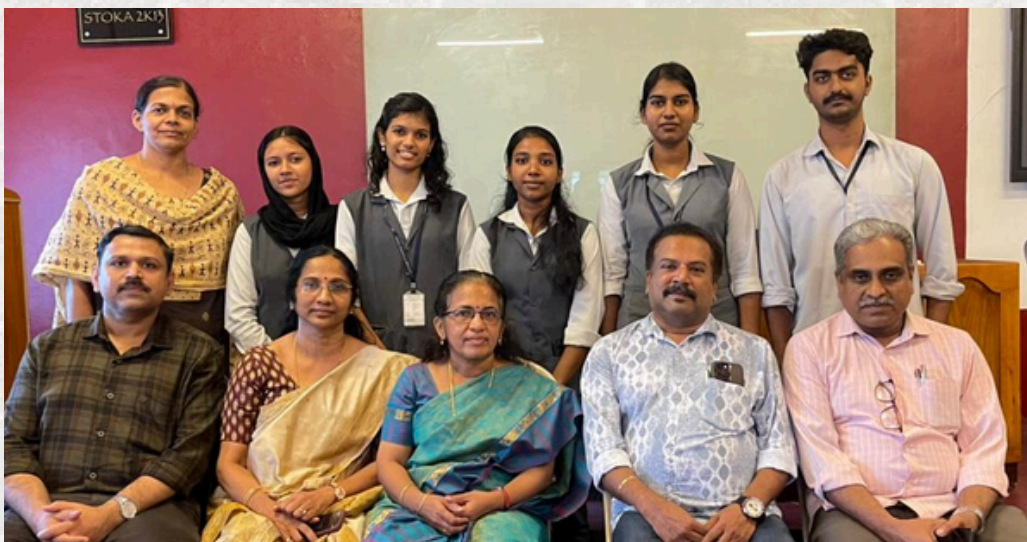
Distribution of scholarship awarded by 1985 batch.