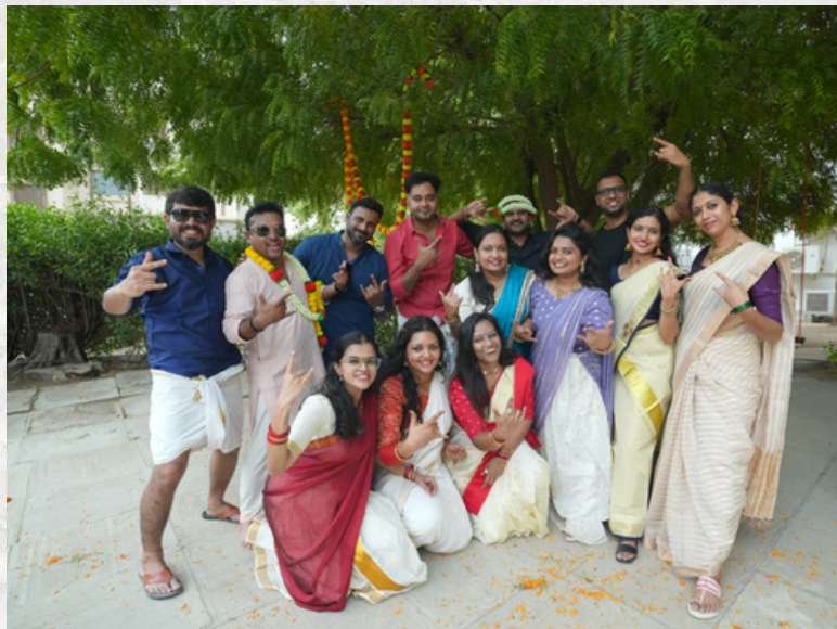
Onam preparations group