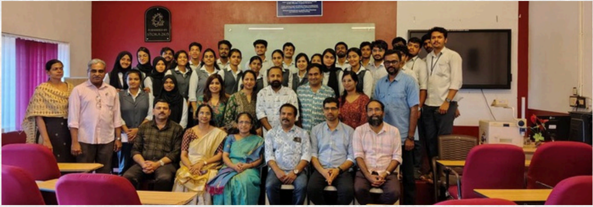
ANECX Qatar Chapter awarded scholarships to 30 deserving students.