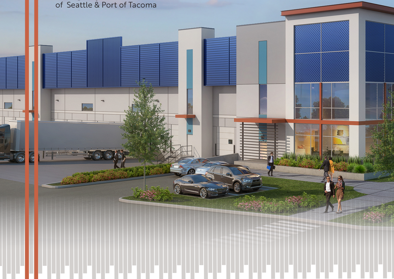
Construction Update October 2025

Strategically located between the Port of Seattle & Port of Tacoma