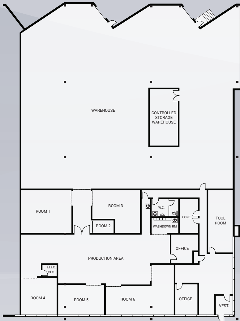
40 COMMERCE | 18,276 SF