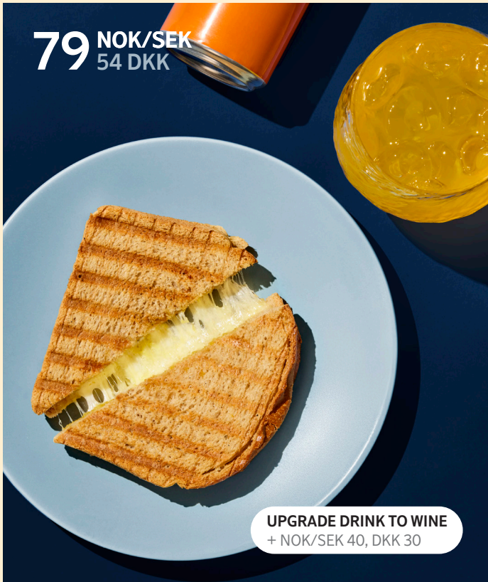
TOAST & DRINK Available on flights over 2h 20 min. Combine 1 toast + 1 soft drink and save 20% DKK 54, NOK/SEK 79, EUR 8, EB 1500