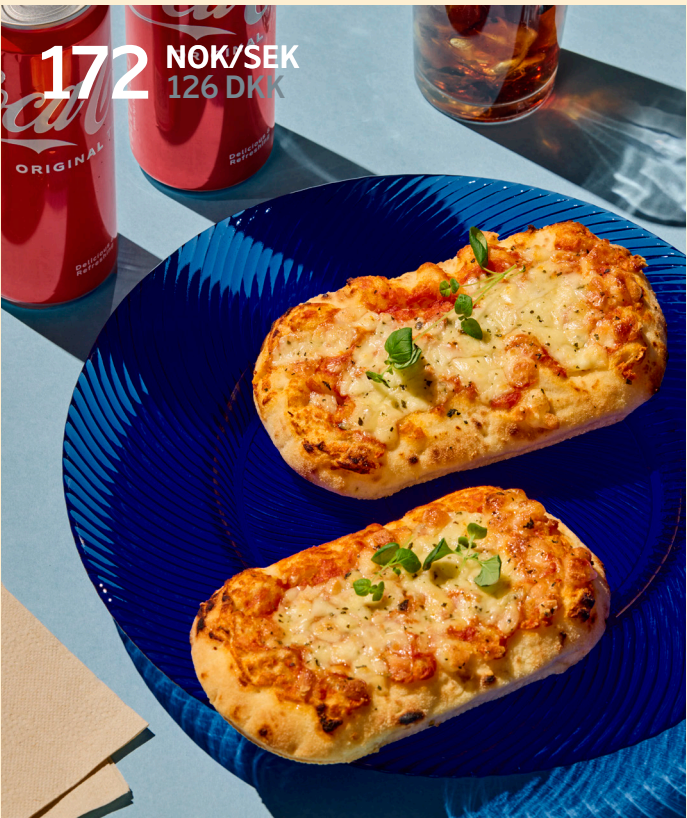
TWO PIZZAS & DRINKS Available on flights over 2h 20 min. Combine 2 pizzas + 2 soft drinks and save 15% DKK 126, NOK/SEK 172, EUR 17, EB 3000