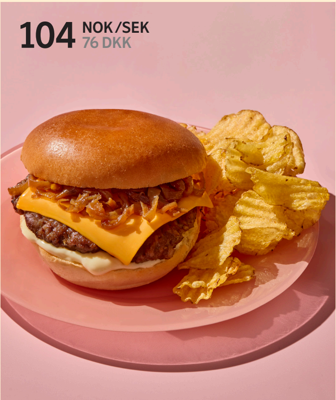
HAMBURGER & CHIPS Available on flights over 2h 20 min. Combine 1 hamburger + 1 bag of chips and save 20% DKK 76, NOK/SEK 104, EUR 10, EB 1950