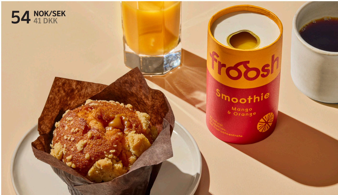
SMOOTHIE & SNACK Combine 1 smoothie + 1 muffin or chocolate ball and save 15% DKK 41, NOK/SEK 54, EUR 6, EB 950