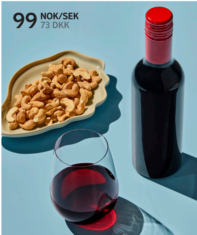
WINE & SNACK Combine 1 red/white wine + 1 bag of chips or cashew nuts and save 20% DKK 73, NOK/SEK 99, EUR 10, EB 1800