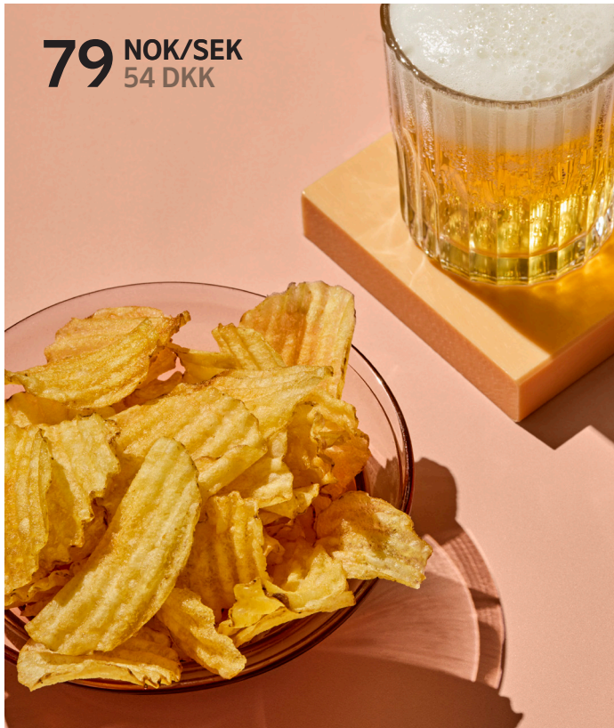
BEER & SNACK Combine 1 Carlsberg Beer + 1 bag of chips or cashew nuts and save 20% DKK 54, NOK/SEK 79, EUR 8, EB 1500