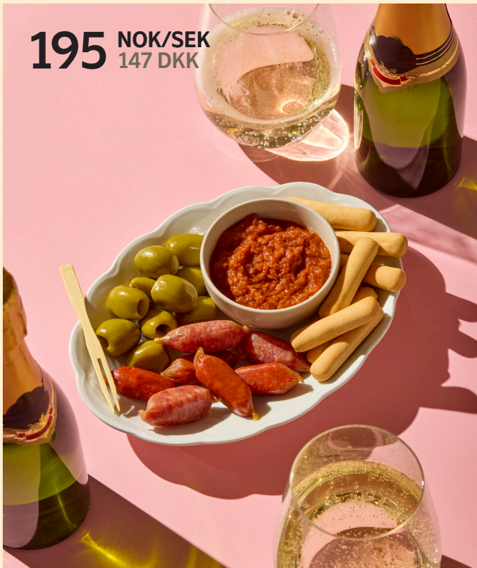
ANTIPASTI & SPARKLING WINE Combine 1 antipasti box + 2 sparkling wines and save 25% DKK 147, NOK/SEK 195, 19 EUR, EB 4000