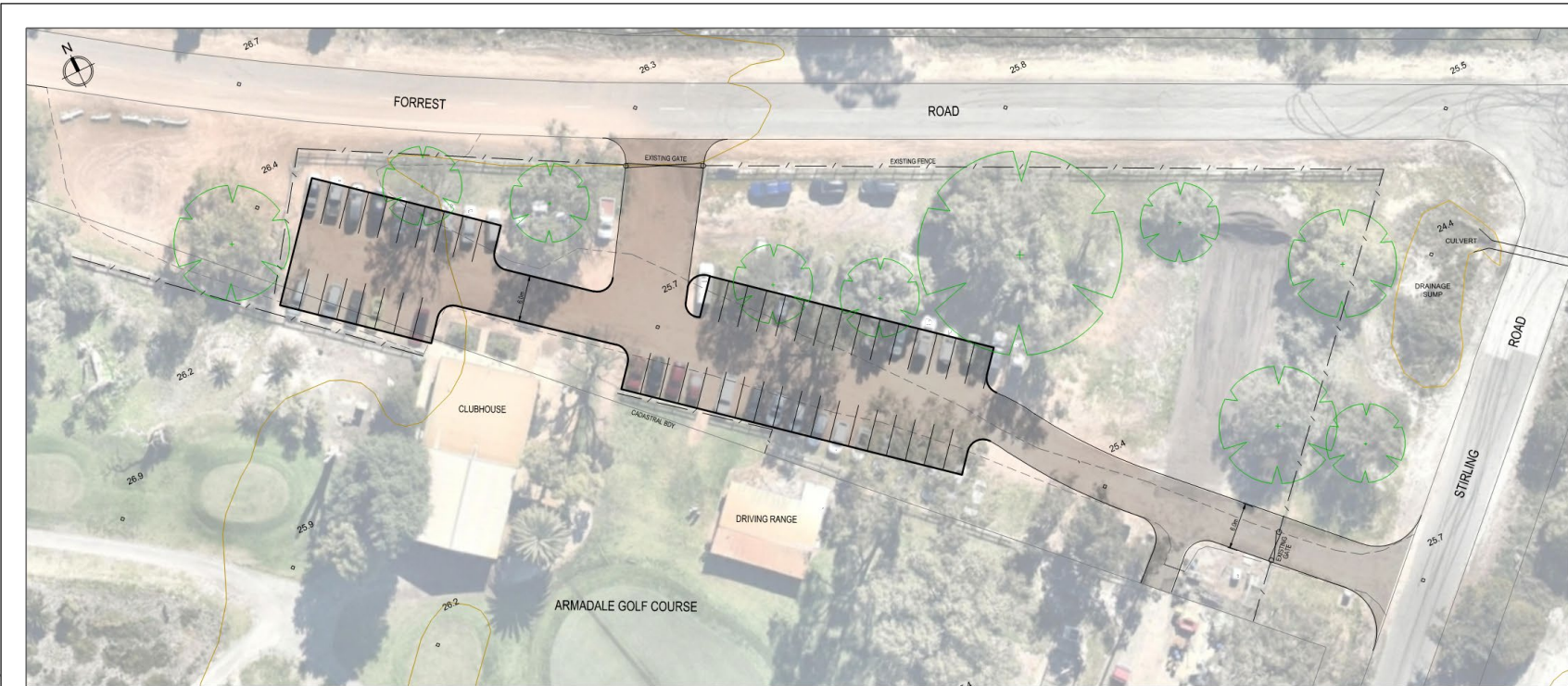
PLAN VIEW SCALE 1:200