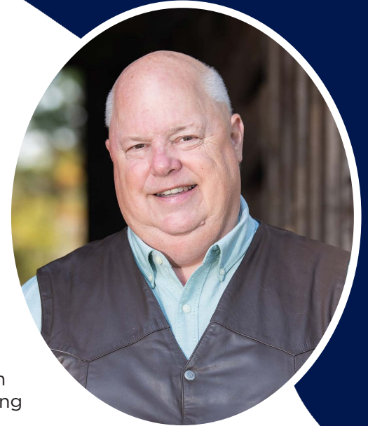
MIKE STRAIN, DVM COMMISSIONER

To learn more, including what qualifies as agricultural burning as it relates to the recent burn ban modification, visit www.ldaf.la.gov/land/fire/safety/statewide-burn-ban .