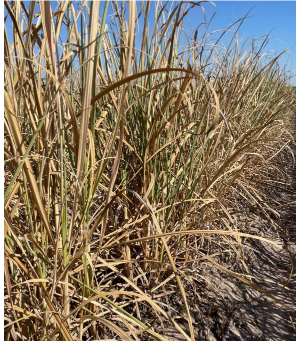
Sugarcane stalks in Chad Hanks' field in Lafayette parish stood 3 feet tall in August, a time that they should have been 7 to 9 feet tall. Hanks was expecting at least a 40% reduction in his crop yields this year due to extremely high temperatures and lack of rainfall.

About half of the total damage, $836.5 million, occurred on farms where crops performed poorly or died. With the lack of usual summer rainfall, farmers also racked up expenses from having to irrigate more often. Soybeans and sugarcane took the hardest