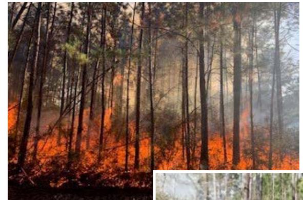
Prescribed burns, such as this one on a Dugdemona SWCD cooperator's property, are used to improve wildlife habitat and reduce wildfire risk.

Through funds generated from their annual tree sale, the Dugdemona SWCD provides conservation education and outreach to local landowners, educators, and students at school events, fairs and local community colleges, as well as providing technical assistance at 4-H and FFA judging events. The conservation programs and activities made available through the Dugdemona SWCD successfully highlight the great public benefit of private lands conservation.