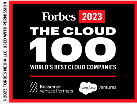
Forbes Cloud 100 list