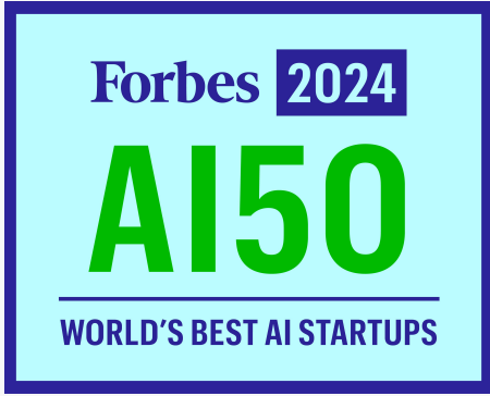
Forbes AI 50 list