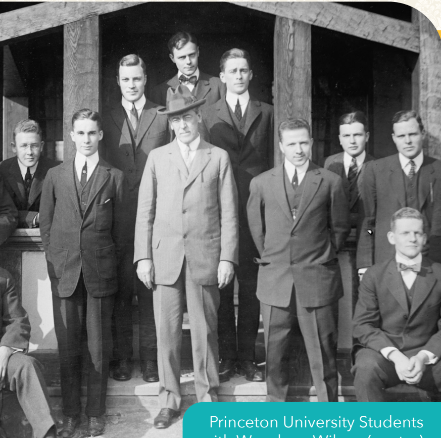
Princeton University Students with Woodrow Wilson (center)