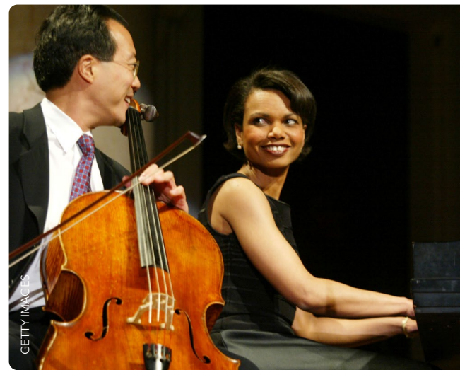
Condoleezza Rice and cellist Yo-Yo Ma perform during the National Endowment for the Arts National Medal of Arts Awards ceremony, April 22, 2002 in Washington, DC.