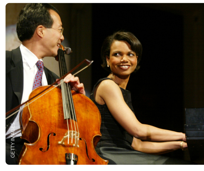
Condoleezza Rice and cellist Yo-Yo Ma perform during the National Endowment for the Arts National Medal of Arts Awards ceremony, April 22, 2002 in Washington, DC.