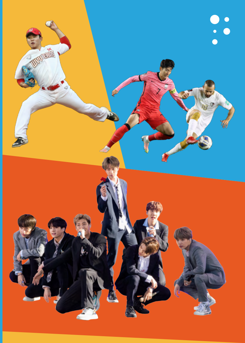
Seoul is the capital of South Korea.

During these same years, South Korea has grown into one of the most successful countries in the world. It is one of the most technologically advanced nations and its citizens are among the best educated. South Korea is home to international business giants like Samsung, Hyundai, and Kia. They have one of the top professional baseball leagues in the world, and their best soccer players compete at the finest clubs in Europe. North Korea has none of this, nor do they have any of South Korea's growing cultural influence. Known popularly as K-Dramas and K-Pop, movies and music from South Korea have become wildly popular around the world—even secretly reaching parts of North Korea.