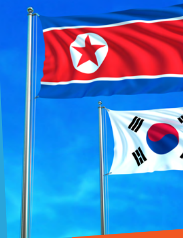
North Korean Flag

A country established in East Asia in 1945. In 1950, its leader, Kim Il-Sung, invaded its neighbor, South Korea. It has had a communist system of government since 1945 and is one of the most oppressive countries in the world.