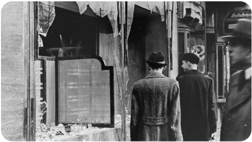
German citizens pass Jewish stores destroyed in Berlin during Kristallnacht, 1938.

In 1933, Adolf Hitler rose to power and promised to rid Germany of the Jews, whom he blamed for all of Germany's problems. Within a few years, half of German Jews were fired from their jobs. Jewish homes and businesses were looted and reassigned to non-Jews. Many Jews were arrested and imprisoned. Because so many Jews wanted to leave Europe, world leaders convened to address the growing problem.