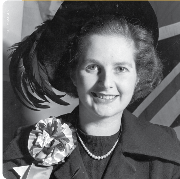
Margaret Thatcher on Women in Politics:

Around this time, Margaret met a wealthy businessman, Denis Thatcher. He shared Margaret's views and supported her political ambitions. They married in December 1951. Two years later, Margaret gave birth to twins Carol and Mark. She returned to school for legal training, specializing in taxation.