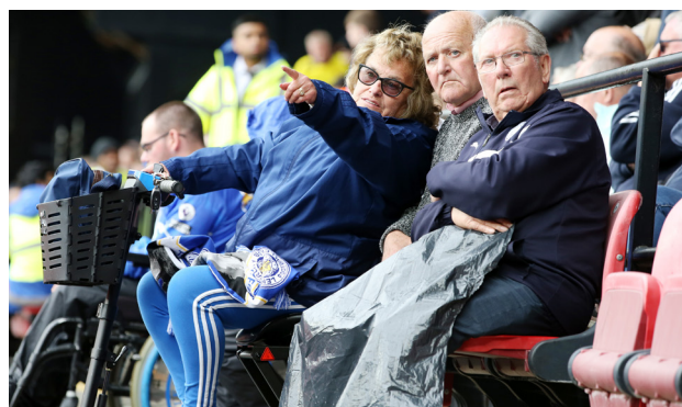
Images: LCFC Fans attending away fixtures