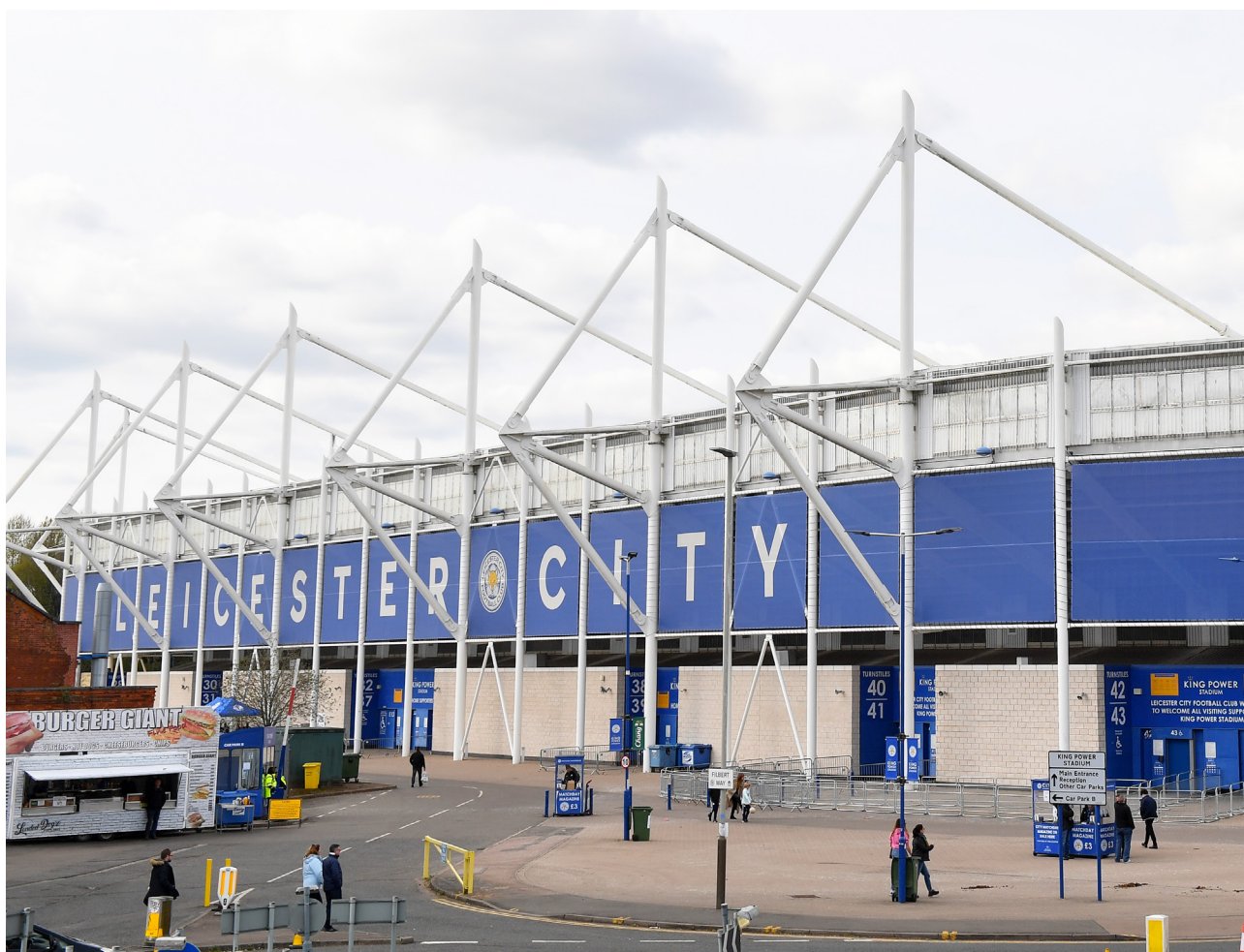
Image: King Power Stadium

For details on routes to Leicester, visit travelineeastmidlands.co.uk