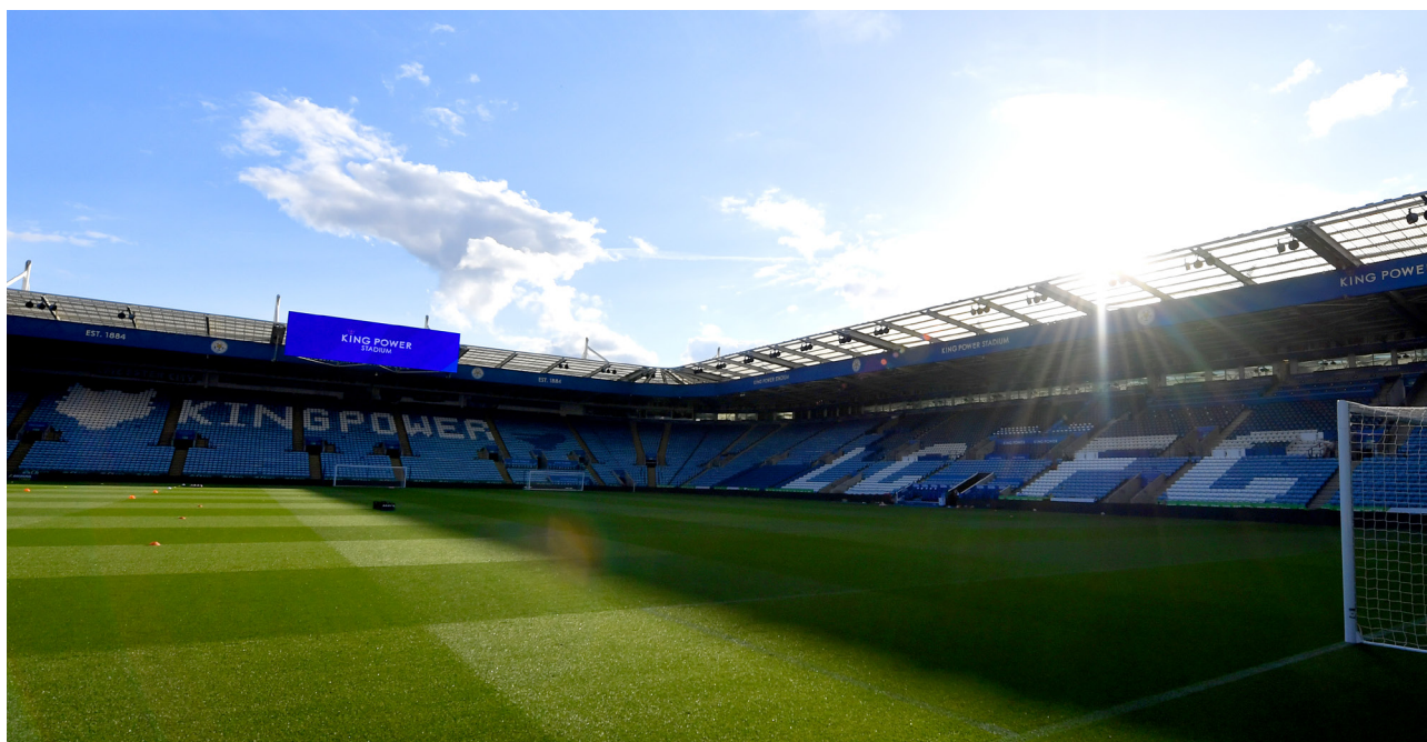
Images: King Power Stadium view of the pitch

If you are reporting a hate crime, please text 'FOXES' followed by your message, seat number and the nature of your concern to 6066.