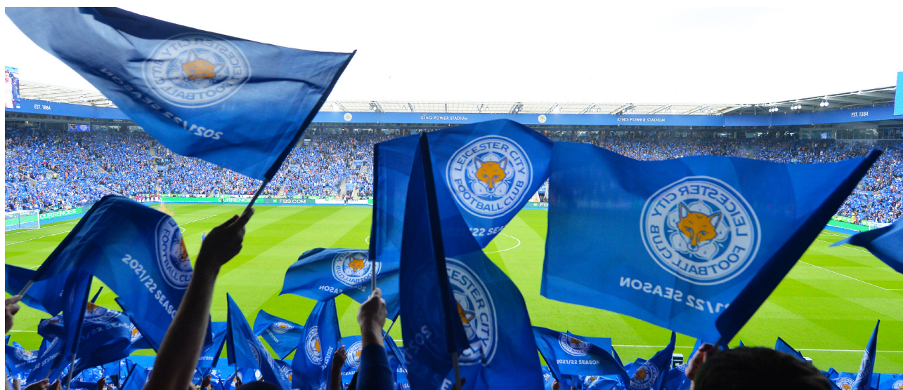
Image: Fans waving flags