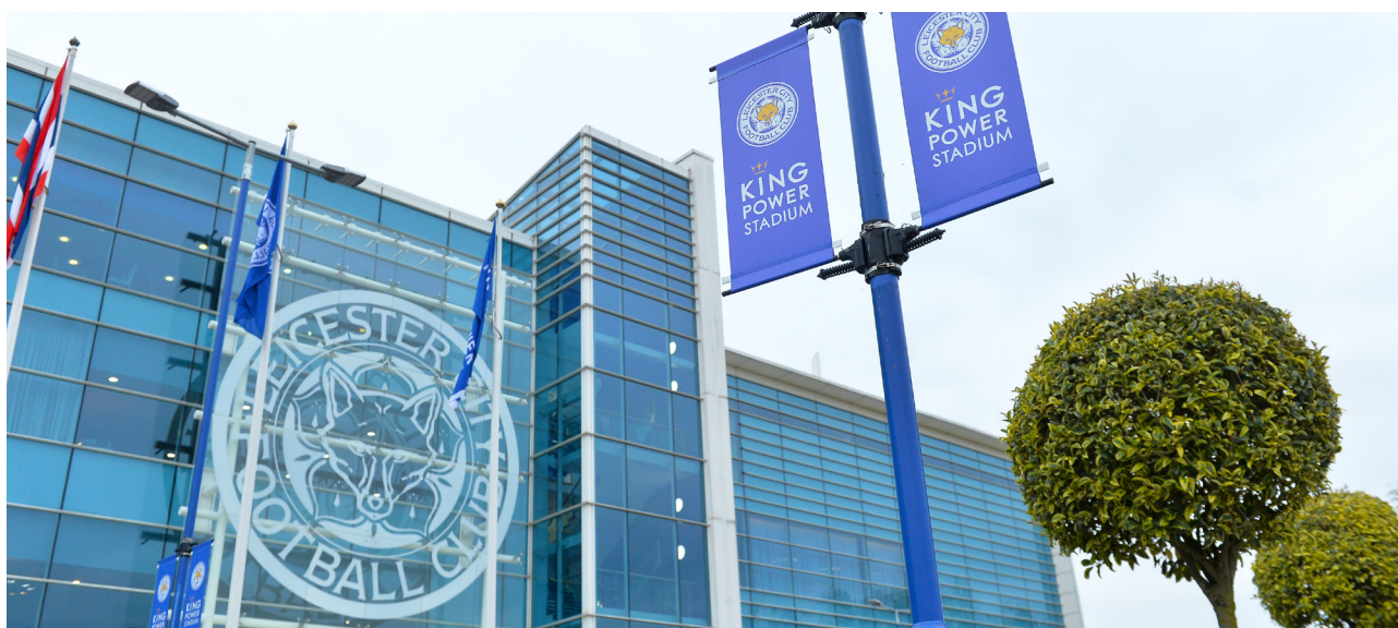
Image: Outside the reception of King Power Stadium