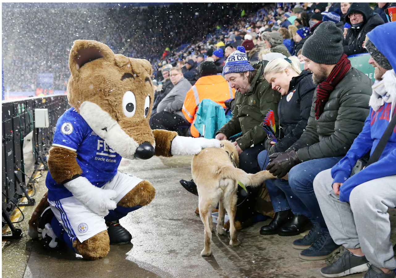
Image: Supporters pitchside