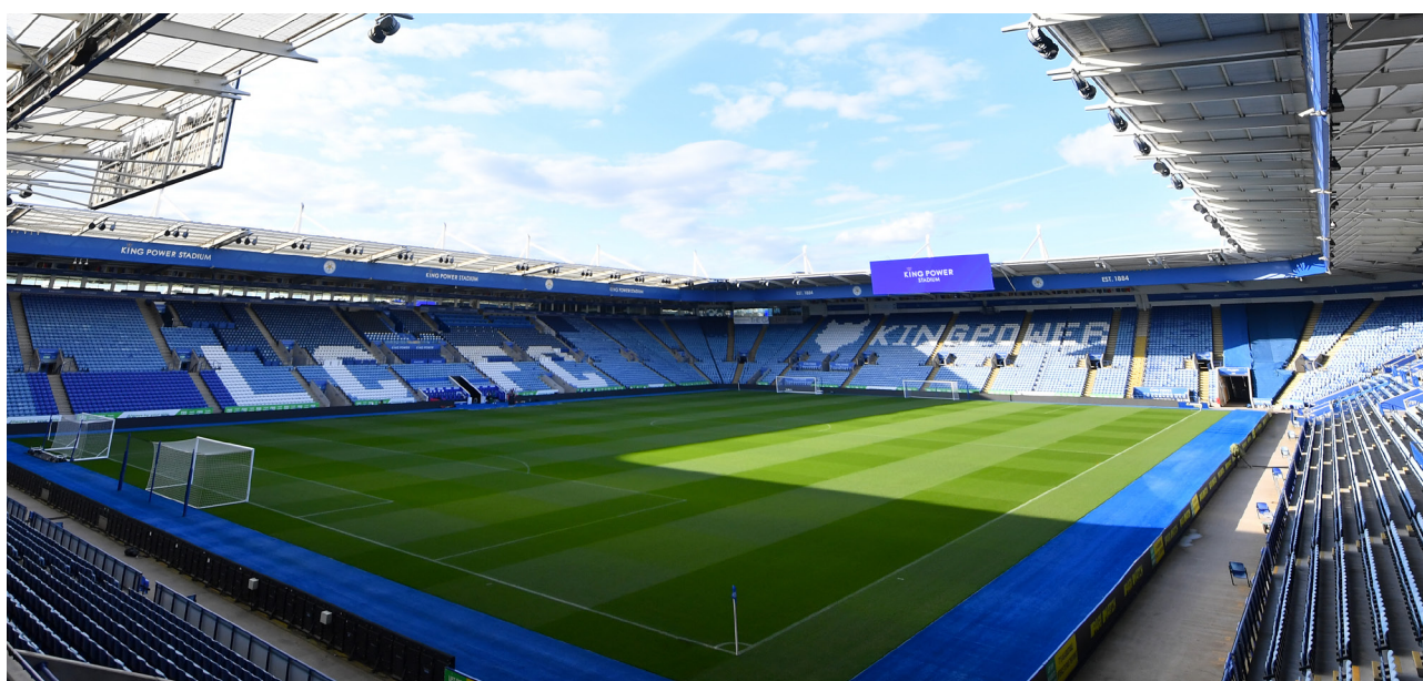
Images: King Power Stadium view of the pitch

Visit the Foxes Fanstore at King Power Stadium