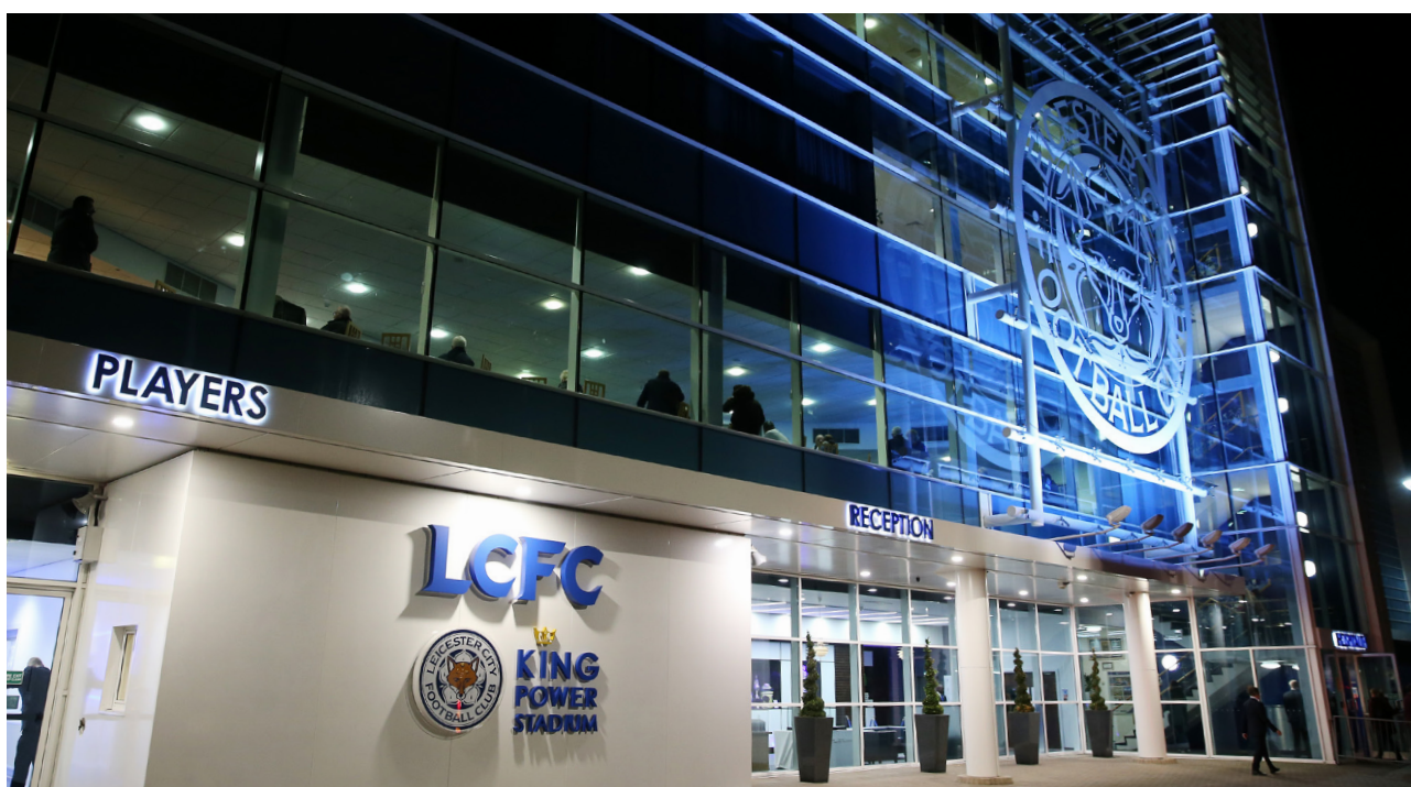
Image: Outside the reception of King Power Stadium at night