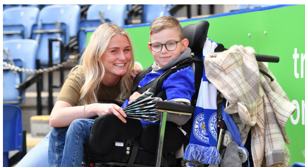
Image: LCFC fans pitchside

Other facilities available for supporters with disabilities to enhance their matchday experience at King Power Stadium, include: