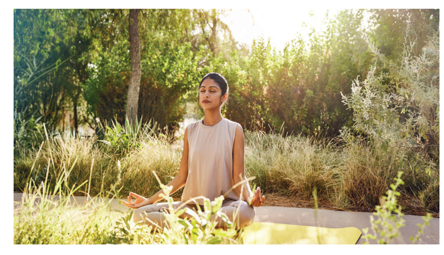
Yoga studio, health & beauty salon, spa and sauna