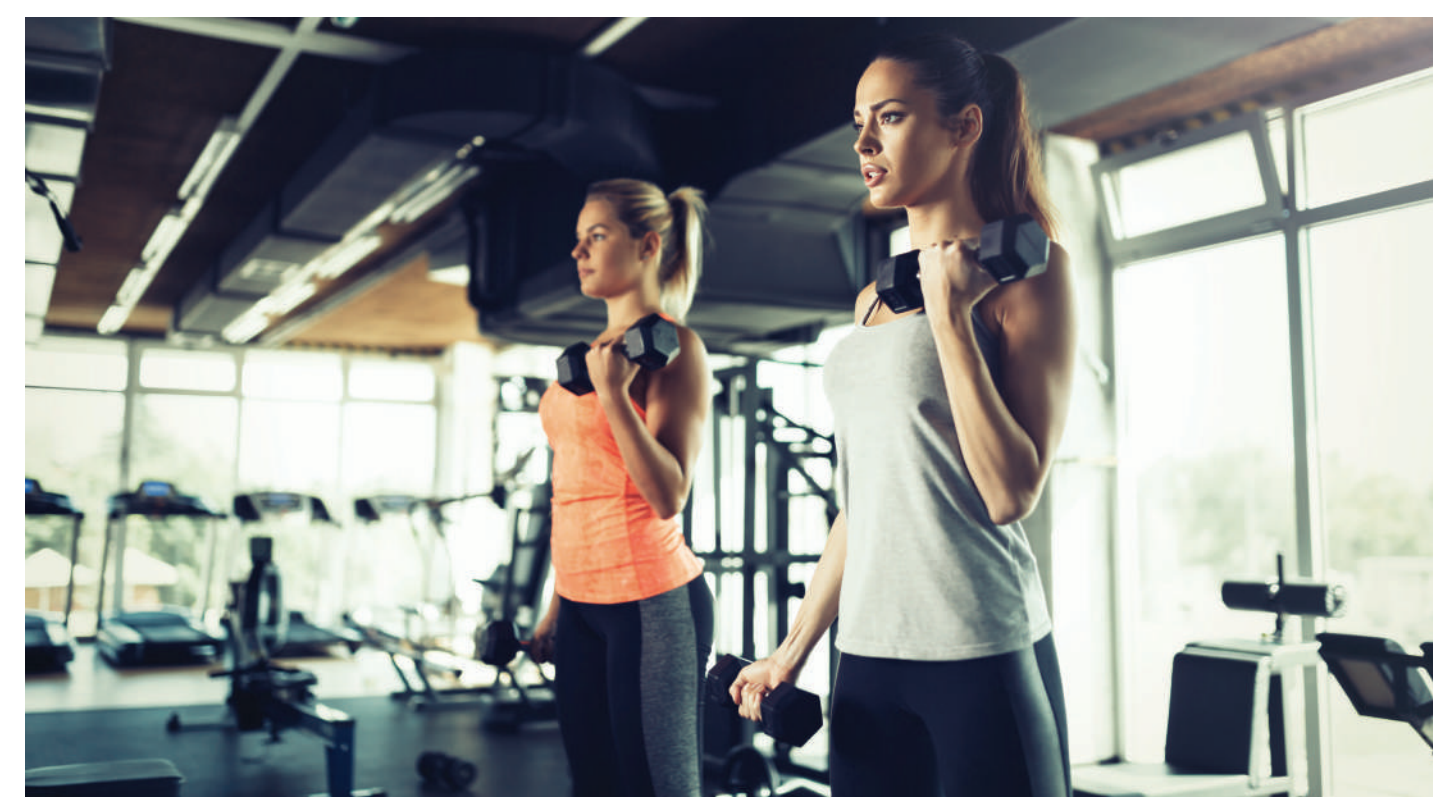
Gyms, outdoor wellness and fitness areas