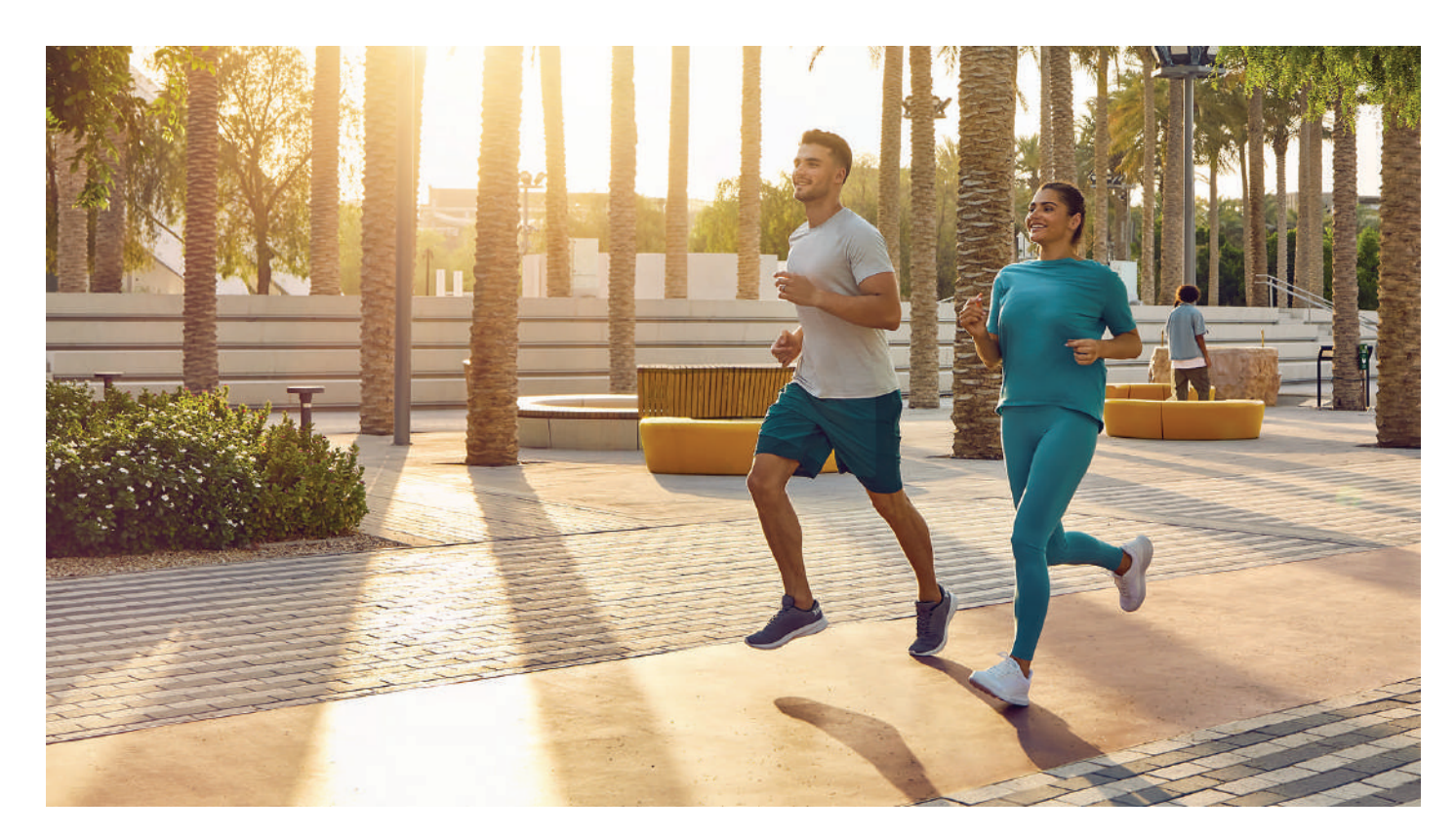
4.5 km of pedestrian tracks and 5.2 km of cycling trails