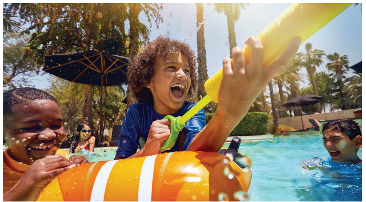
Swimming pools, splash pads and kids' play areas