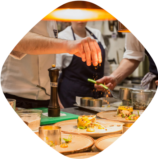
Food & Beverage

Short description goes here. Short description goes here. Short description goes here.