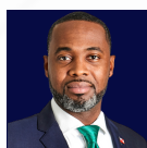
Hon. E. David Burt Premier, Government of Bermuda .....

11:30-11:35 Special Message | Global Regulatory Developments