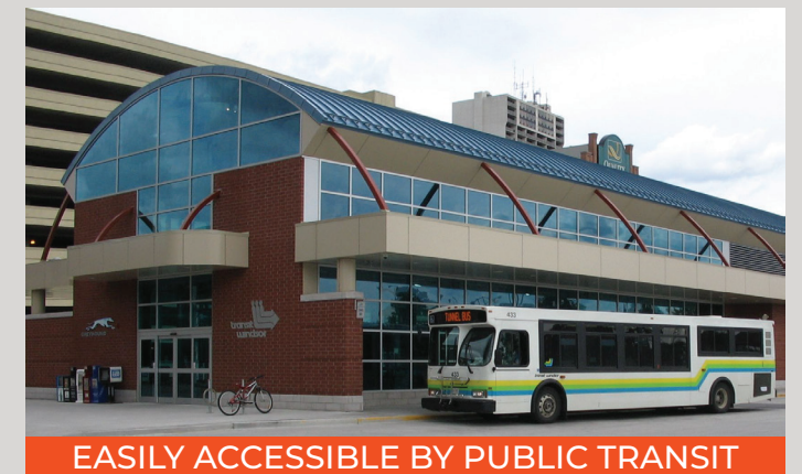
EASILY ACCESSIBLE BY PUBLIC TRANSIT