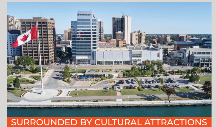
SURROUNDED BY CULTURAL ATTRACTIONS