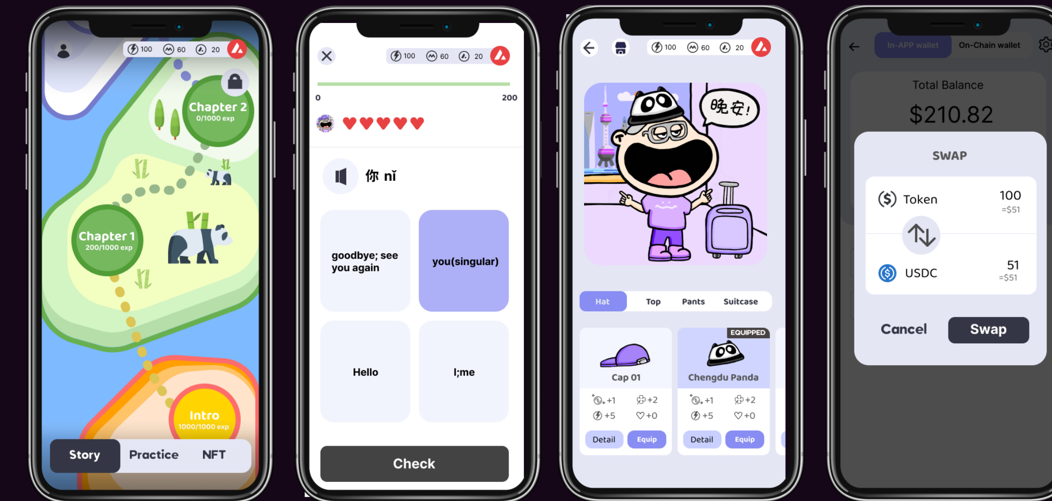
Story Mode Learning NFT Equipment Wallet