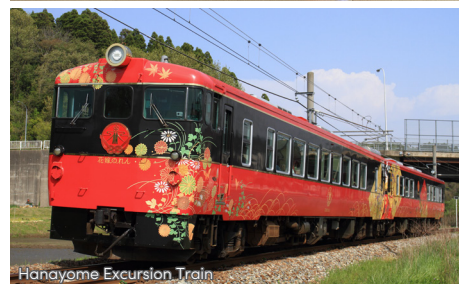
Hanayome Excursion Train