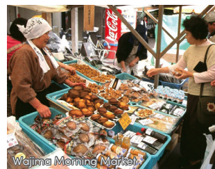
Wajima Morning Market

Head back to Kanazawa on the Hanayome Excursion Train . The train's exterior is inspired by Kaga Yuzen silk-dyeing and Wajima lacquerware , with the interior featuring traditional Wajima patterns that allow passengers to experience Japanese beauty in every carriage. If you make a reservation in advance, you can also enjoy a bento box lunch featuring local cuisine and seasonal ingredients from Ishikawa Prefecture. (Return home)