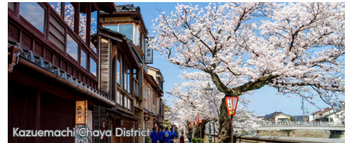
Kazuemachi Chaya District

Your trip starts in the Higashi Chaya District , an old townscape with traditional teahouse architecture dating back 200 years. After visiting a teahouse, an integral part of Kanazawa's cultural heritage, visitors can enjoy local sweets and take a rest at a café. Next, head to the Kazuemachi Chaya District , where cherry blossoms bloom along the river. Enjoy the views from the bridge and opposite bank, or take a stroll under the rows of sakura. Make your way through the narrow streets to the foot of the kuragari-zaka slope where you'll find a lone cherry blossom standing serenely among a carpet of petals.