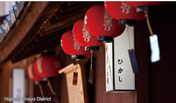
Higashi Chaya District