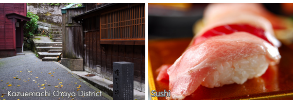
Kazuemachi Chaya District