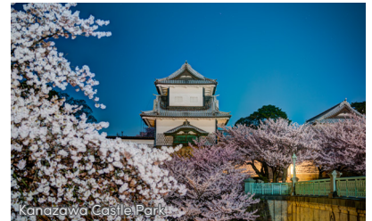
Kanazawa Castle Park

Before dinner, visit Kenrokuen , one of the most beautiful traditional gardens in Japan. Created with the utmost care and skill, the garden is home to 420 cherry blossoms of over 40 different varieties, and offers beautiful spring scenery. Next to Kenrokuen is Kanazawa Castle Park , with 400 cherry blossoms of its own. Here you can enjoy the beautiful contrast between the white of the castle and the striking pink of the sakura. Kenrokuen and Kanazawa Castle are lit up after sunset, creating a fantastic scenery different from that during the daytime. For dinner, go out for sushi , a specialty of Ishikawa. There are many sushi restaurants in Kanazawa of which to choose, where skillful chefs prepare fresh fish from the Sea of Japan.