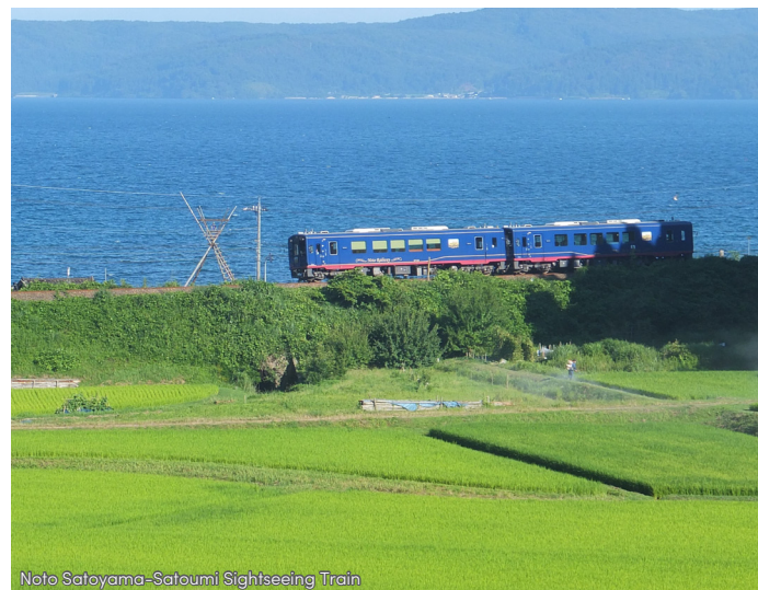
Noto Satoyama-Satoumi Sightseeing Train