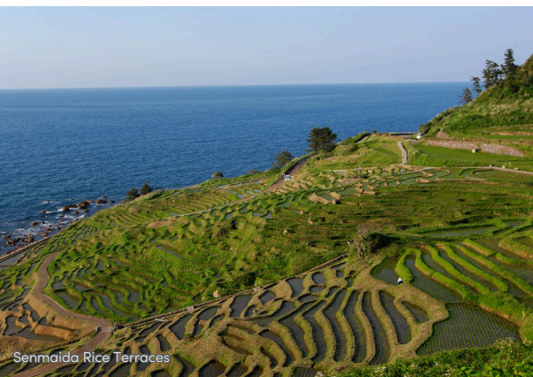
Senmaida Rice Terraces