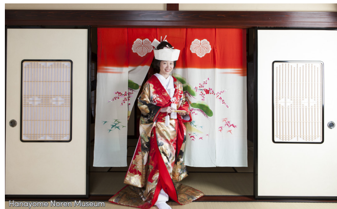
Hanayome Noren Museum