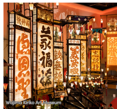
Wajima Kiriko Art Museum

Venture out a little further for a stroll around the Senmaida Rice Terraces , one of Noto's most famous landscapes, where over 1,000 rice paddies stretch out in layers across the steep slopes to the sea. Enjoy the color contrast of the paddies and the Sea of Japan while marveling at the efforts of the people who continue to maintain the area by hand. (Stay overnight in Wajima)