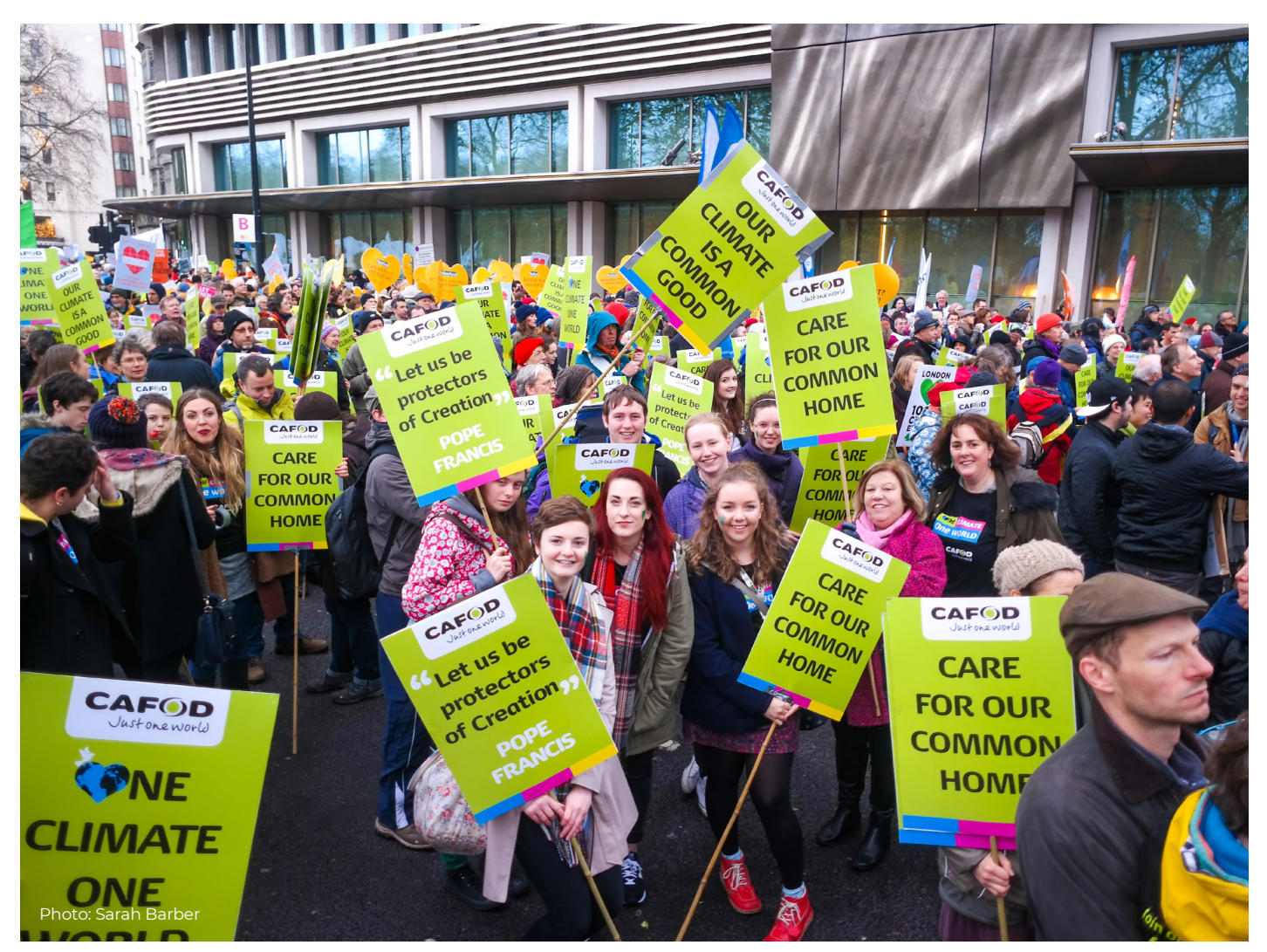
Climate Peoples March in the UK.

The Church has played a significant role in many countries in strengthening governance. It has done this through training and supporting citizens to engage with their governments, speaking out against abuse of power, and providing oversight for free and fair elections and democratic transitions.