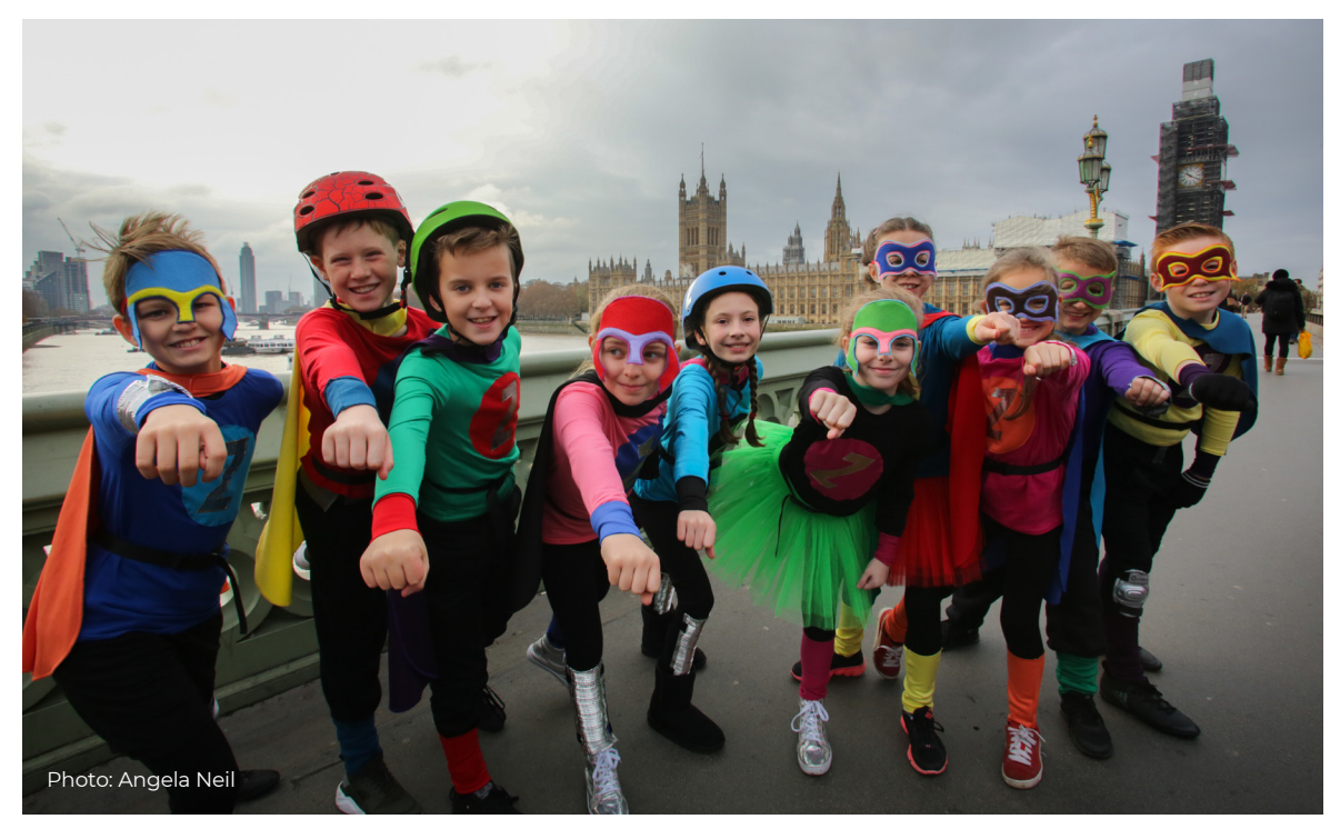
Ten 10-year-old children from St Peter's Roman Catholic School, Billericay, UK, dressed in superhero costumes to mark the tenth anniversary of the Climate Change Act 2008