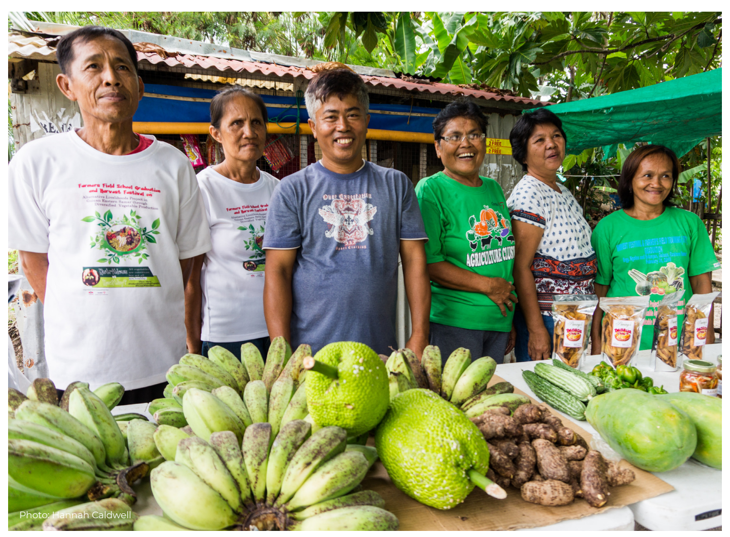
New ways of earning a living following Typhoon Haiyan in the Philippines

The Church development organisations are present at local level and support many communities, both rural and urban, towards sustainable livelihoods. Their ongoing presence and wide range of interventions enable them to engage in the full spectrum of community activities, including sustainable agriculture, conflict resolution, women's participation, organisational development and health and sanitation provision. The length of time they have served communities and their understanding of local people mean that communities are open and willing to learn from them new methods of farming and land management, to become more sustainable both economically and environmentally, such as in Zambia and Zimbabwe .