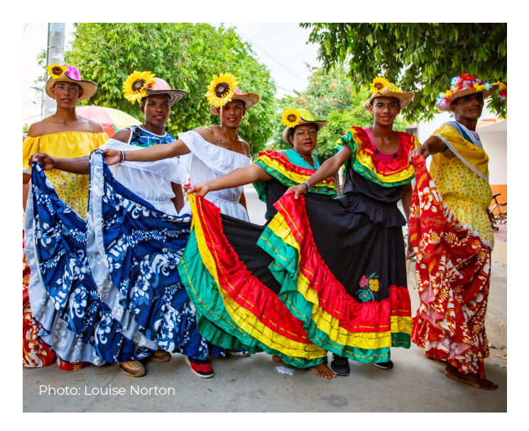
A project in Colombia to tackle conflict in the area and improve dialogue and peacebuilding. A youth dance group set up by FUREC. Many of the dancers haven't been to school.

In some of these cases, there has also been a change of behaviour and norms within the Church itself. The Church too has had to face up to some of its own discriminatory behaviour, for example towards people living with HIV or where it has turned a blind eye to child marriage or genderbased violence.