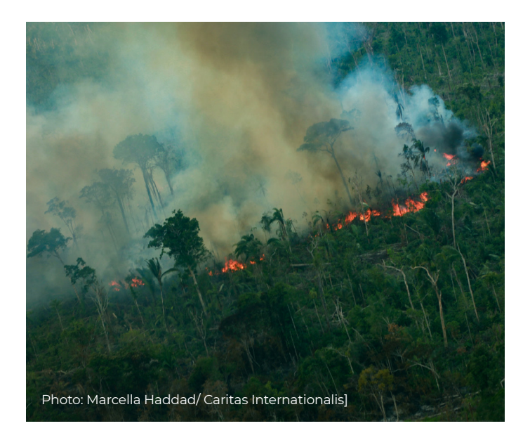
Burning of the Amazon rainforest in Brazil.

For decades, the role of the Church in Brazil has been to serve the most vulnerable communities. It