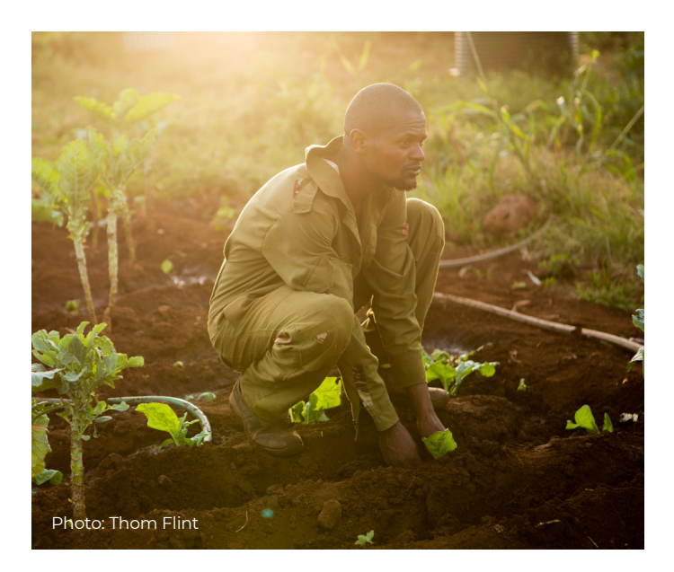
Climate Resilient Agriculture in Marsabit, Kenya.

The support to help families invest in organic agriculture has produced some striking results. Among the greater variety of crops being grown that are suited to the local climate and soil