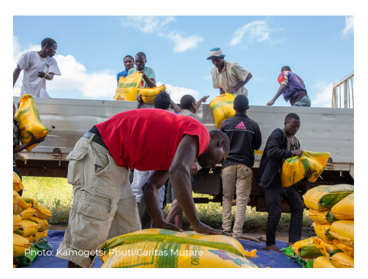
Distributions of food and essential household items for people affected by Cyclone Idai in Zimbabwe.

In the Philippines , the national Caritas (NASSA) responded<sup>12</sup> to the devasting 2013 Typhoon Haiyan (local name, Yolanda) by providing survivors with emergency kits, shelter, water and sanitation. Its network of leaders, parishes and volunteers throughout the Philippines enabled the Church to be first responders: they were already on the ground, before any international help arrived. The Church used its local buildings and schools that remained standing as temporary shelters for the worst affected and most vulnerable people. After the immediate response, NASSA supported the community in constructing disaster-resilient houses and in rebuilding their livelihoods. Fundraising and technical support for NASSA was coordinated through Caritas Internationalis, which mobilised