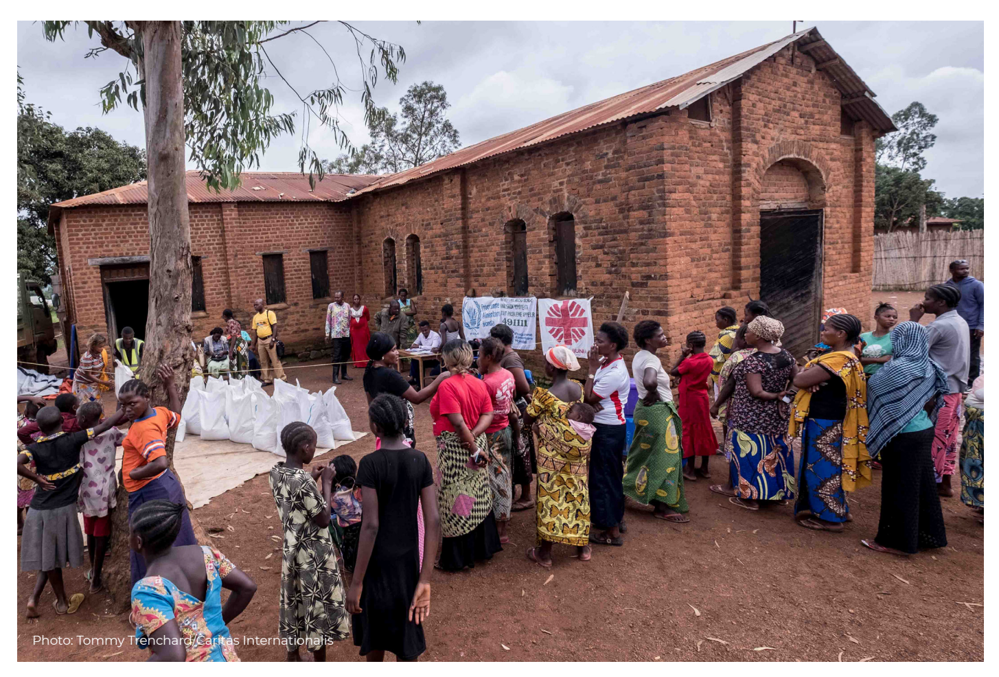
Caritas food distribution at a church in Marabo, DRC, a town that was hit badly by Ebola .