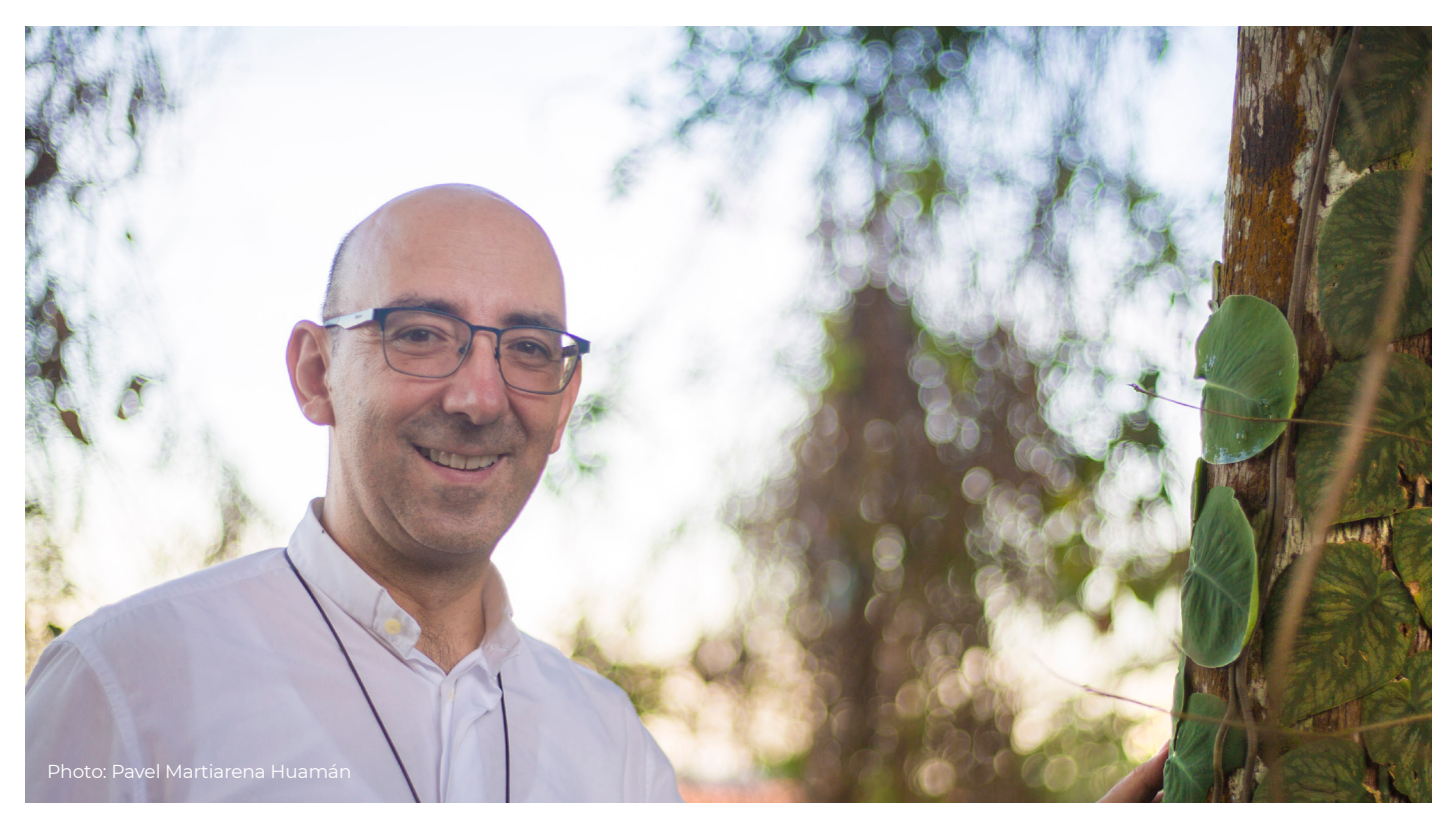
Bishop David Martínez de Aguirre Guinea, Peru.

The church has a calling to speak truth to power and has used this prophetic voice towards governments, companies and the international community. The Church is called to be politically impartial, in that it is above party politics. But its commitment to the common good and 'a preferential option for the poor' puts the Church firmly on the side of democracy, justice and defending the rights of the most vulnerable people and communities.