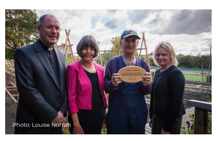
Livesimply award celebration, St Benedict's Garforth, Leeds diocese, UK.

and health centres, and the Church is one of the few institutions that commands wide respect and trust across a big and divided country. The Catholic Bishops' Conference trained 40,000 citizens to act as electoral observers in the 2017 election and played an informal oversight role in judging election results, limiting the opportunities for electoral fraud and contributing to a reduction in violence during the election period.