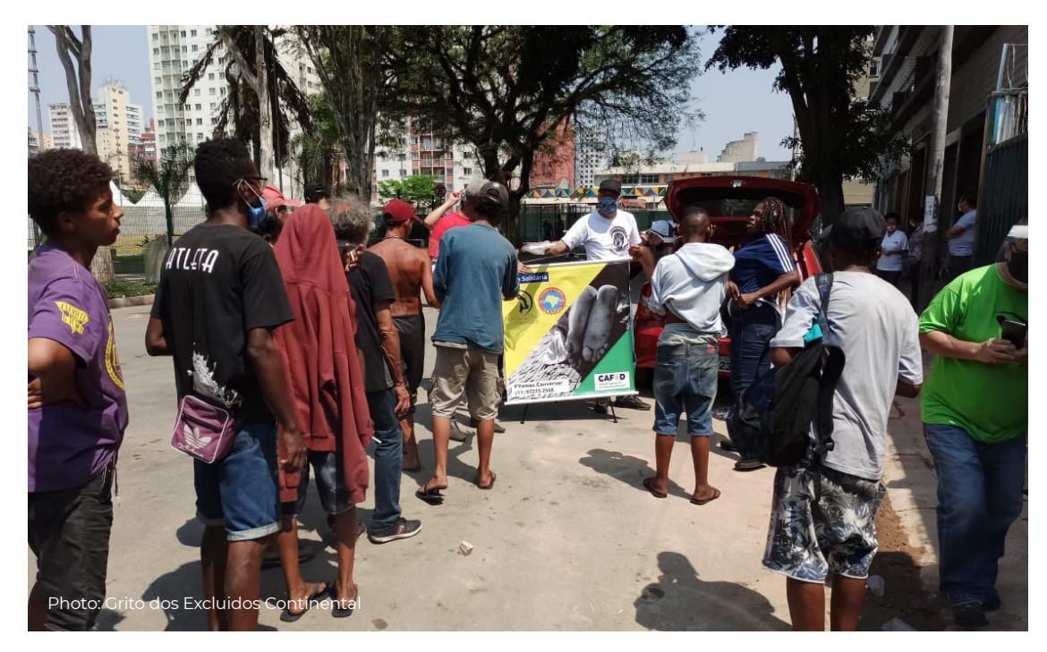
Emergency support to homeless people in São Paulo, Brazil during coronavirus.