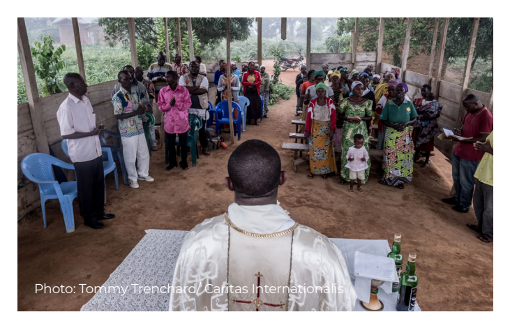
Caritas has trained priests and other faith leaders to spread Ebola prevention messages and instigate handwashing at all ceremonies in DRC.

In Mozambique the Church has spoken out against the previously taboo subject of trafficking in human organs for witchcraft. This was in a context where people have been afraid to speak out for fear of retaliation for themselves or their families and of becoming victims of witchcraft themselves. The detailed research into the extent of trafficking and teaching around human dignity changed the debate on what is seen as culturally acceptable in terms of trafficking human organs for witchcraft.