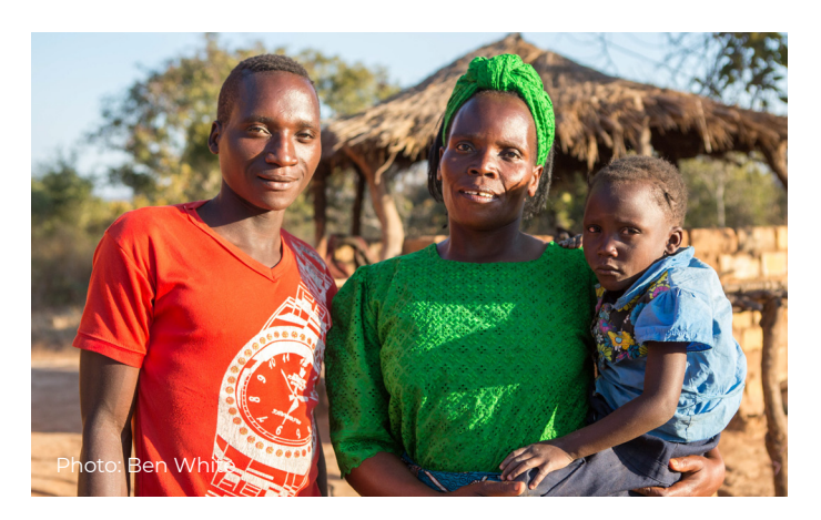
Beauty's family at home. Households in Distress (HID) programme, Zambia,

Within the first section on humanitarian response, we have added an extra section at the start on how the Church has responded to the current context of coronavirus.