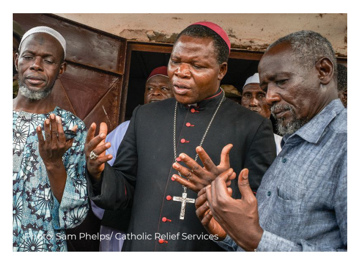
Archbishop Dieudonné Nzapalainga of Bangui joins Muslims in prayer for an end to the crisis, Central African Republic.

The Church is active in peacebuilding, mediation and reconciliation at all levels, due to its trusted role and presence in communities. It is seen as an impartial actor seeking the common good and speaking out for those whose voices may not be heard. Taking an empathetic approach, the Church has brought warring communities together in Kenya and Ethiopia , which has led to community reconciliation, protection of land and livestock, and a significant reduction in loss of life.