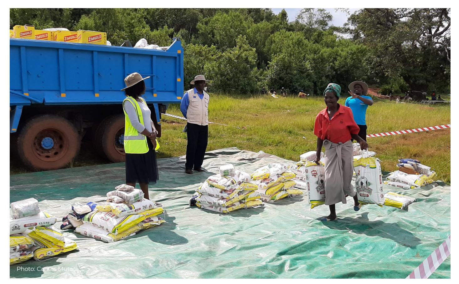
Food distributions and sharing health and hygiene messages during the coronavirus outbreak in Zimbabwe