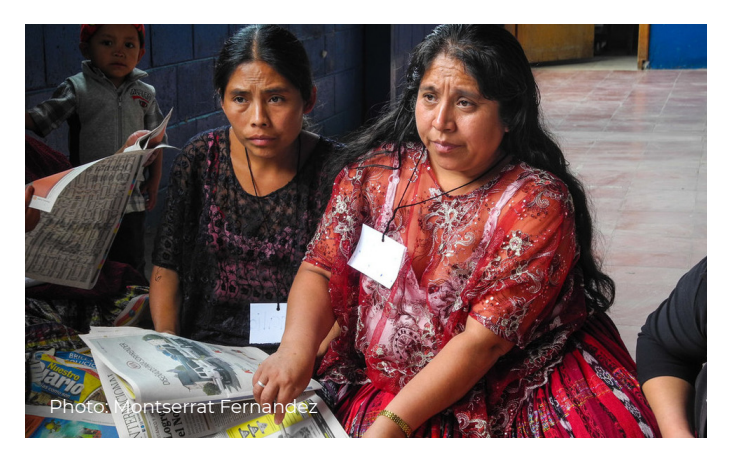
Mayan indigenous women participating in a human rights workshop in Guatemala.

of difficulty and despair, and a voice of peace in times of violence. This is seen in the many pastoral letters that national and regional Bishops' Conferences and individual bishops have written, such as at the end of the civil war in Sri Lanka, after a thawing of relations between Ethiopia and Eritrea, and ahead of elections in Kenya. These letters are usually read out in churches across the country and often attract national media coverage, influencing the national debate. Pope Francis has also spoken out on many issues of global importance, including releasing his encyclical Laudato Si' - on Care for our common home - just months before the 2015 climate change talks in Paris, seeking to highlight the urgency of climate change and to influence the level of ambition of governments and business.