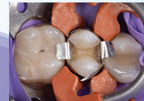
Preparation with Halo matrix system