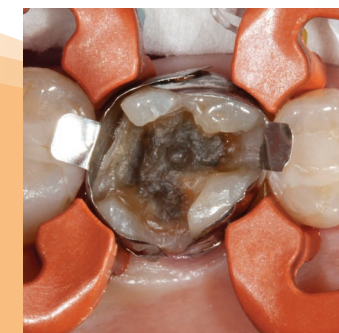
Preparation with Halo matrix system