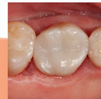
Post-op with Transcend composite Universal Body shade