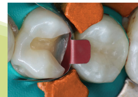
Preparation with Halo system