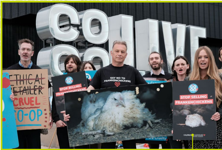
Chris Packham protesting franken chickens with THL UK.

Intensive workshops with the OWA are significantly expanding support to member organizations in Africa, Asia, and Latin America, equipping groups with critical skills for corporate campaigning and strategic planning, and building natural alliances. The groups are already securing more meetings with corporate targets to push for stronger commitments to animals.