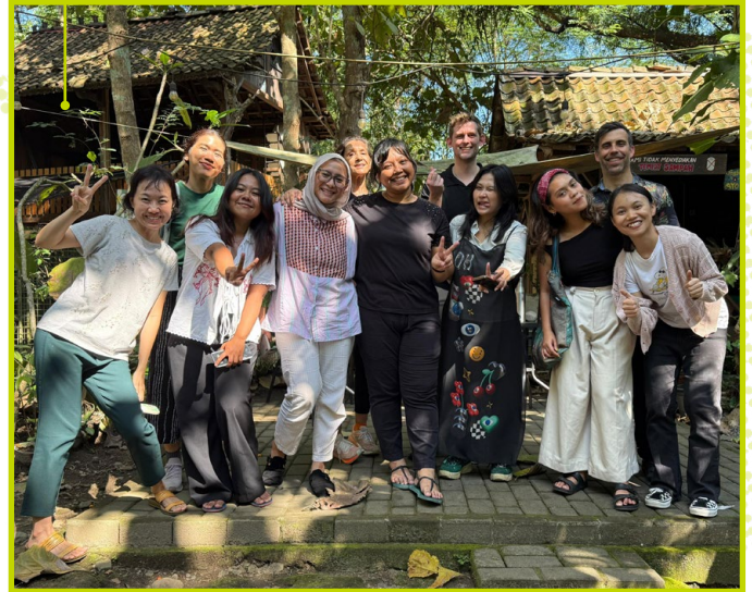
OWA Asia campaign accelerator workshop in Yogyakarta, Indonesia.

Viking Cruises became the first major cruise line to be 100% cage-free after fulfilling its global cage-free commitment in just two short years.