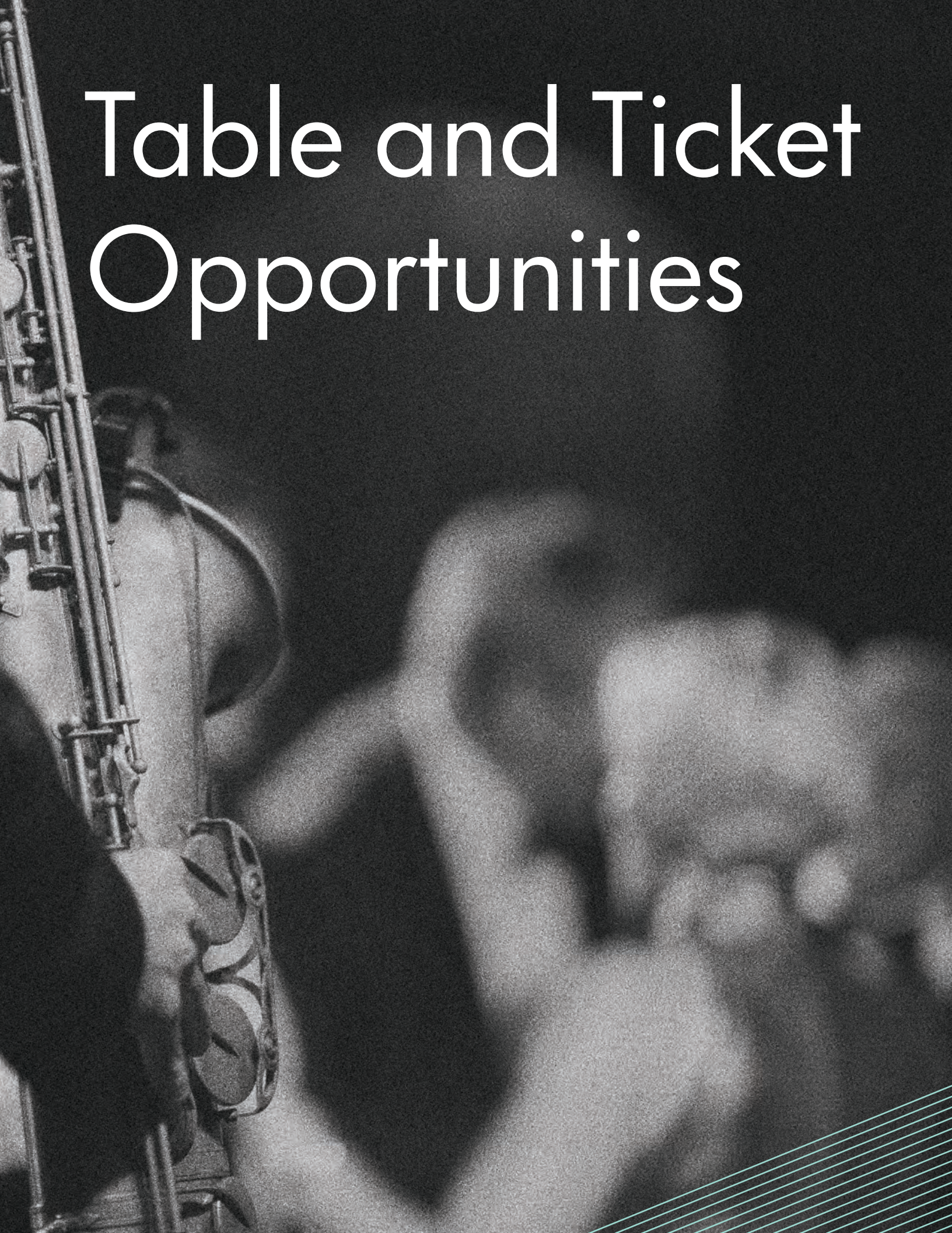
Table and Ticket Opportunities