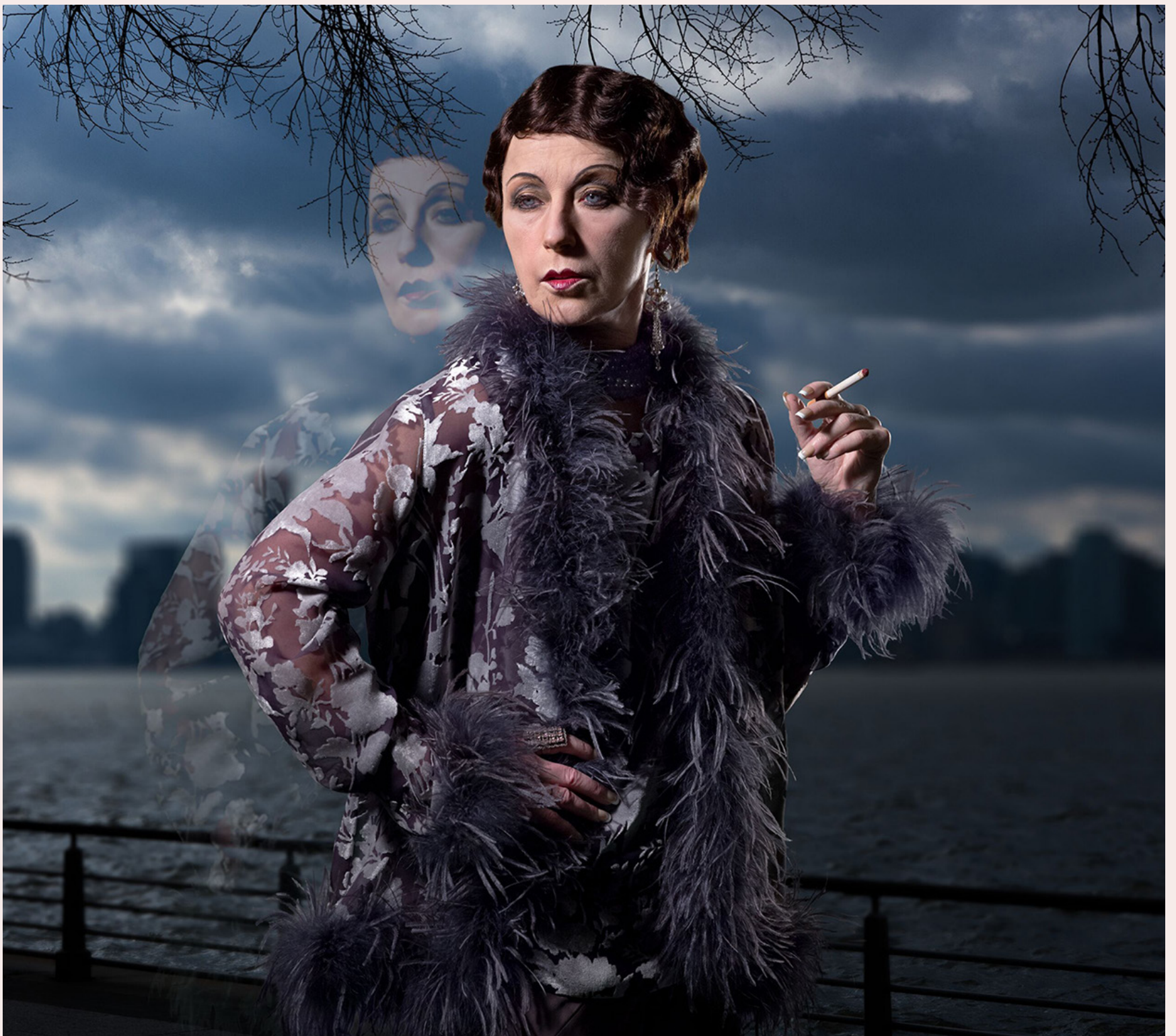
Cindy Sherman, Untitled #566, 2016