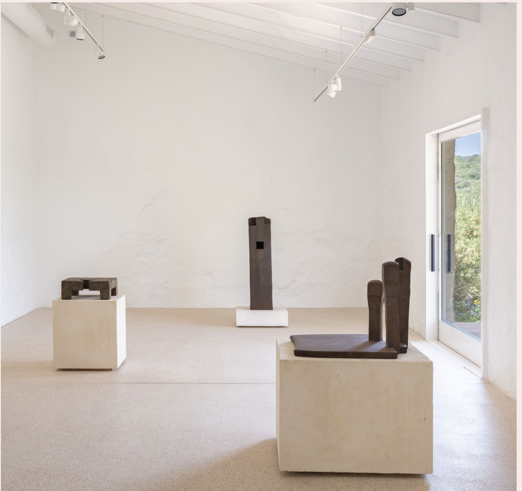
Installation views, ‘Eduardo Chillida,’ Hauser & Wirth Menorca, 2025.