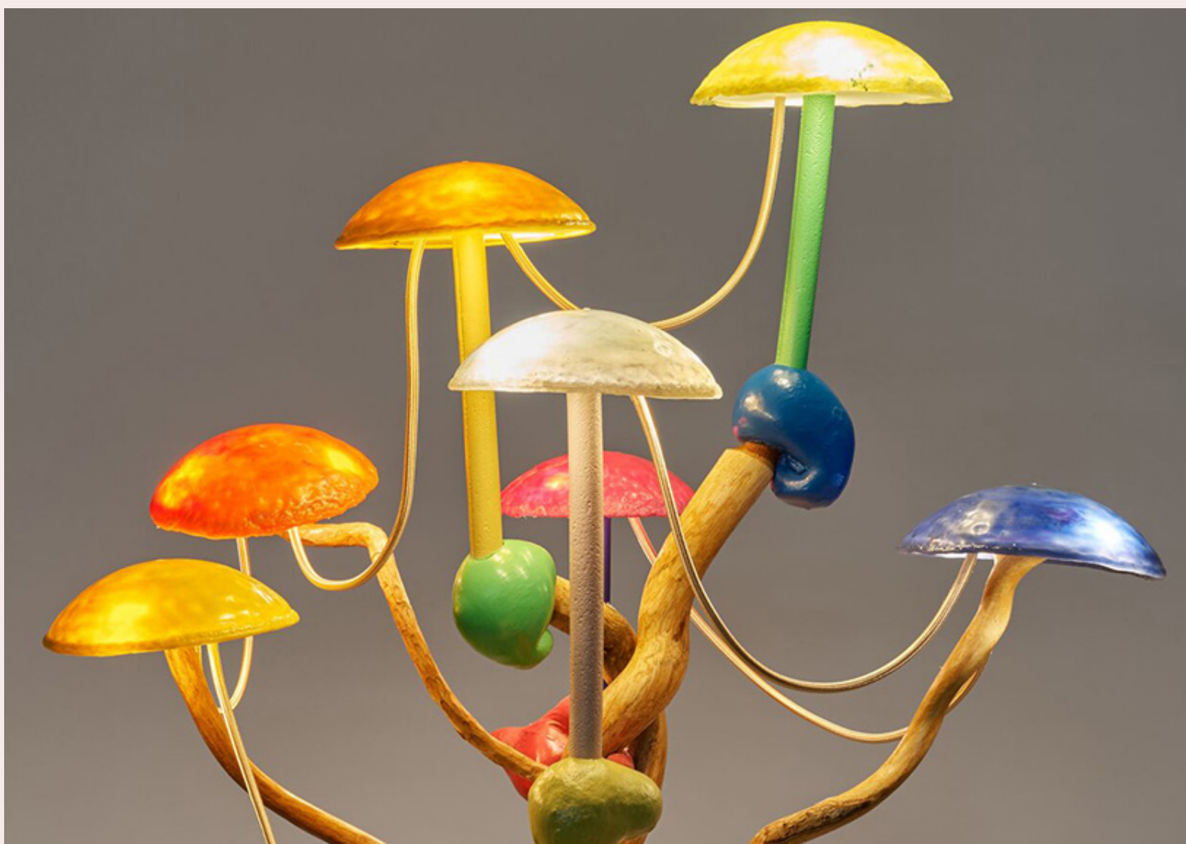
Mika Rottenberg, Lampshare (detail), 2023