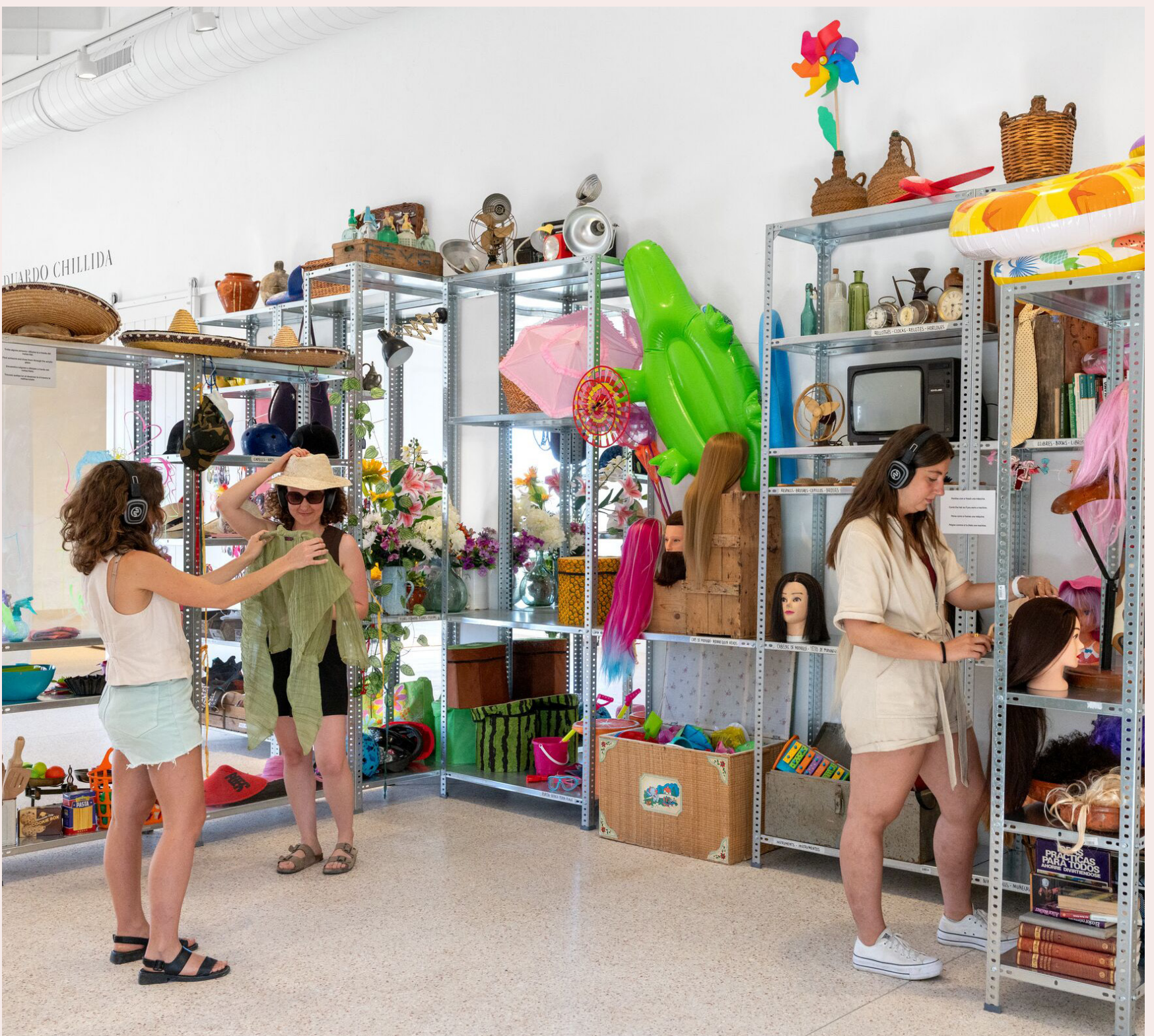
Installation view, Education Lab, 'Play your Part,' Hauser & Wirth Menorca, 2025.