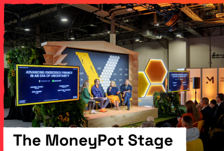
The MoneyPot Stage

NVIDIA hosted a summit in partnership with Oracle on GenAI in Banking and Fintech that covered the realities of what it takes to implement an innovative strategy around the most groundbreaking technology of our time.